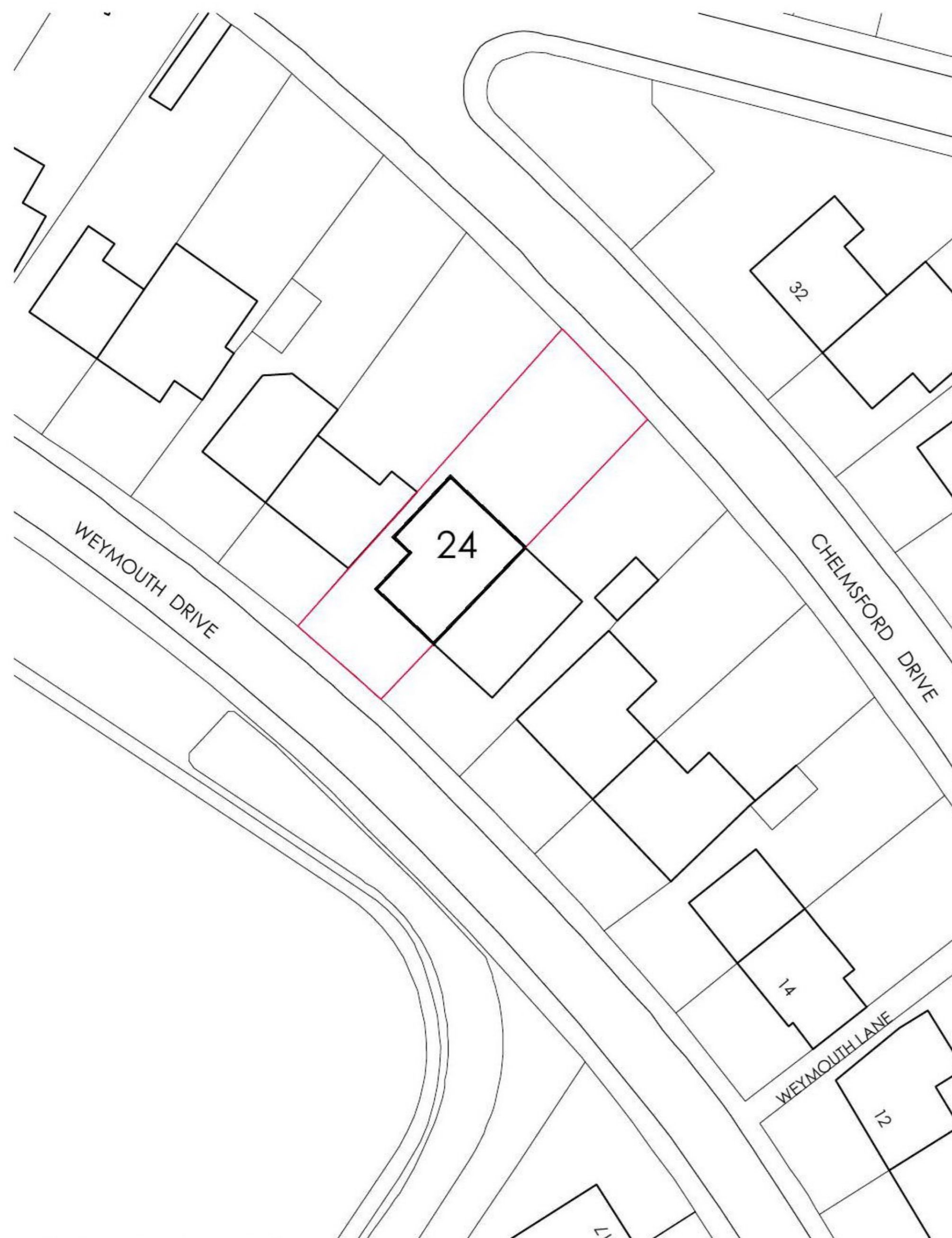
BLOCK PLAN AS EXISTING