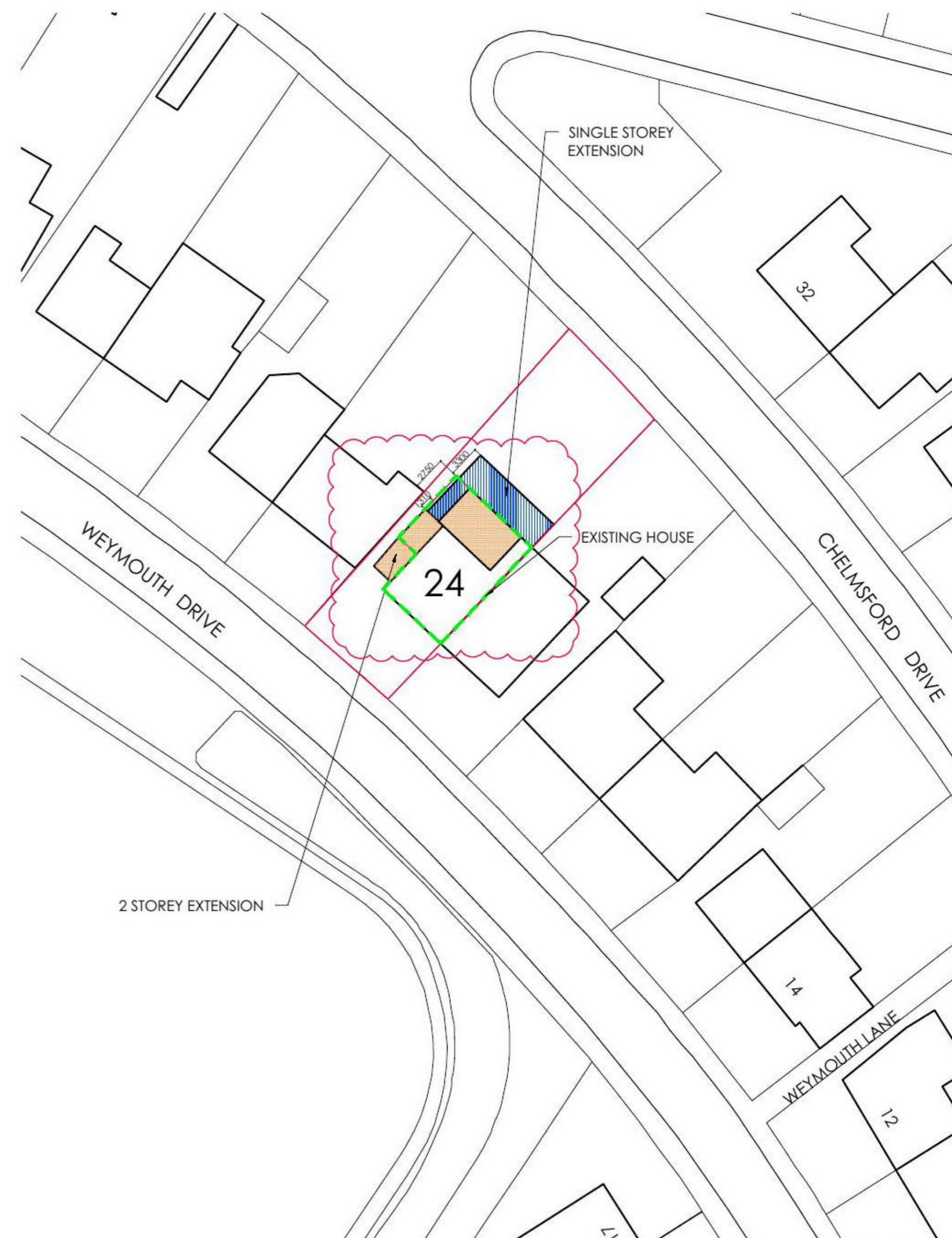
BLOCK PLAN AS PROPOSED

Rev.C. 23/03/2021 AMENDED FOR PLANNING APPLICATION Rev.B. 24/02/2021 AMENDED FOR PRE-APPLICATION Rev.A. 18/12/2020 proposed extension amended