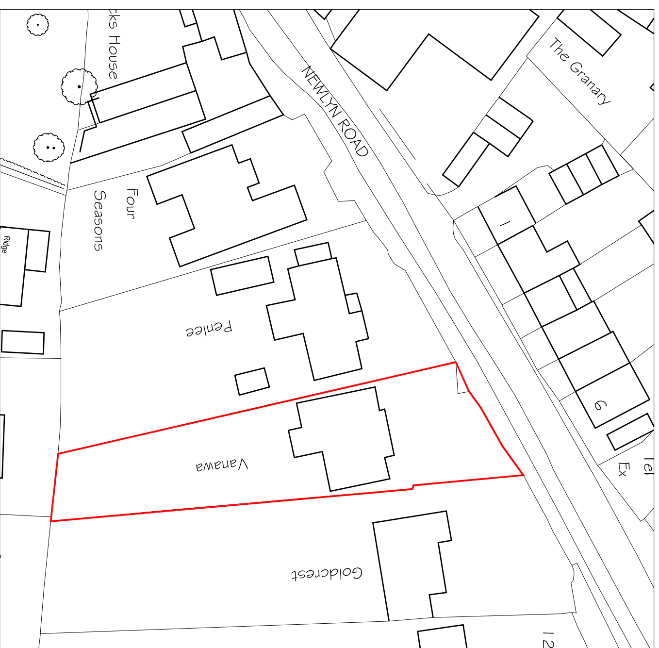
BLOCK PLAN. Scale 1:500

Matthews Johns Associates Unit 17, Dowren House, Hayle, Cornwall, TR27 4HD tel: (01736) 759555