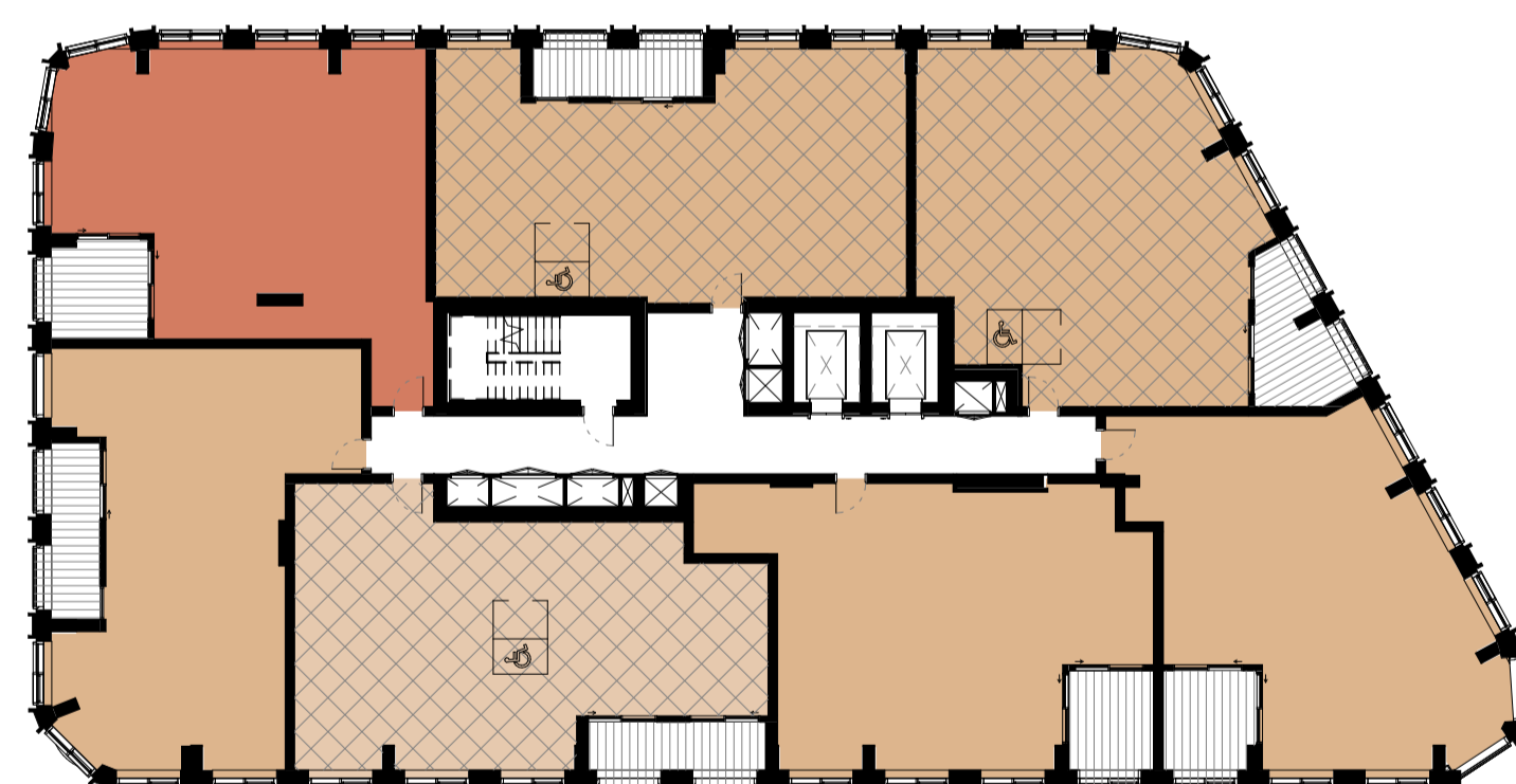
Block J - Typical 02, Level 12 Social

Wheelchair Accessible Unit Ref: 15044-SQP-02-ZZ-DP-A-PL01206 15044-SQP-02-ZZ-DP-A-PL01207 15044-SQP-02-ZZ-DP-A-PL01208 15044-SQP-02-ZZ-DP-A-PL01209 15044-SQP-02-ZZ-DP-A-PL01205 15044-SQP-02-ZZ-DP-A-PL01210