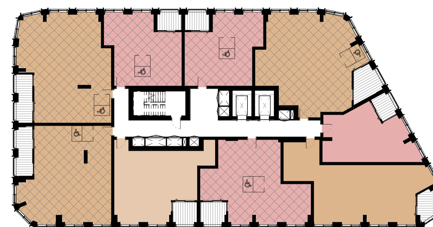
Block J - Typical 01B, Level 11 Social & Intermediate

Wheelchair Accessible Unit Ref: 15044-SQP-02-ZZ-DP-A-PL01204 15044-SQP-02-ZZ-DP-A-PL01205