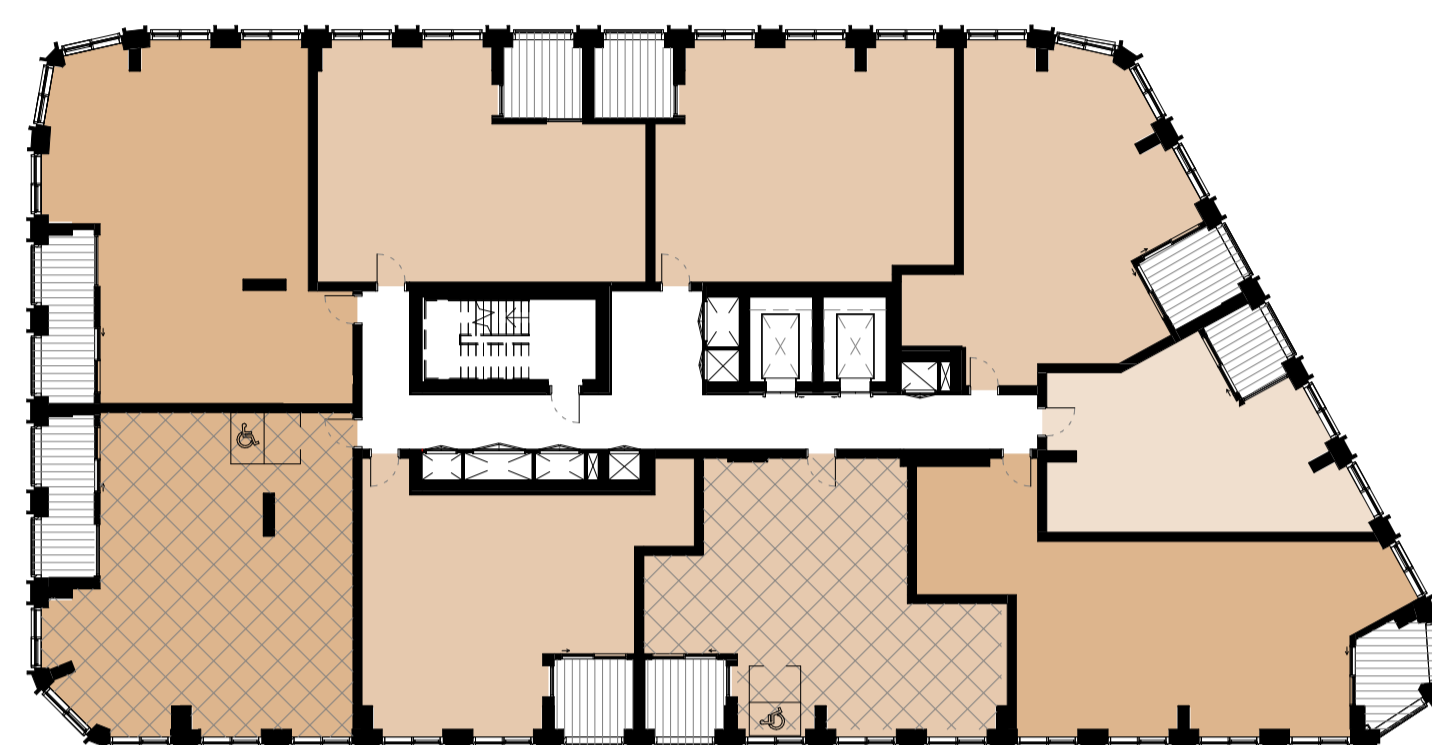
Block J - Typical 01A, Levels 3-10 Social

Wheelchair Accessible Unit Ref: 15044-SQP-02-ZZ-DP-A-PL01204 15044-SQP-02-ZZ-DP-A-PL01205