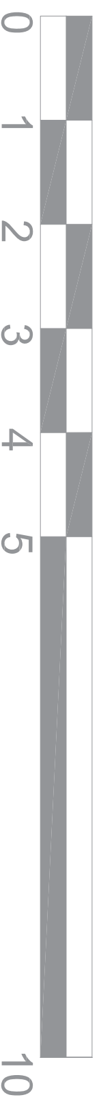
SCALE BAR 1:50

Any errors and omissions to be reported to the Architect prior to commencement. Dimensions and areas are based on survey information provided by the client. This drawing is copyright © KDS ARCHITECTS. All dimensions to be checked on site.