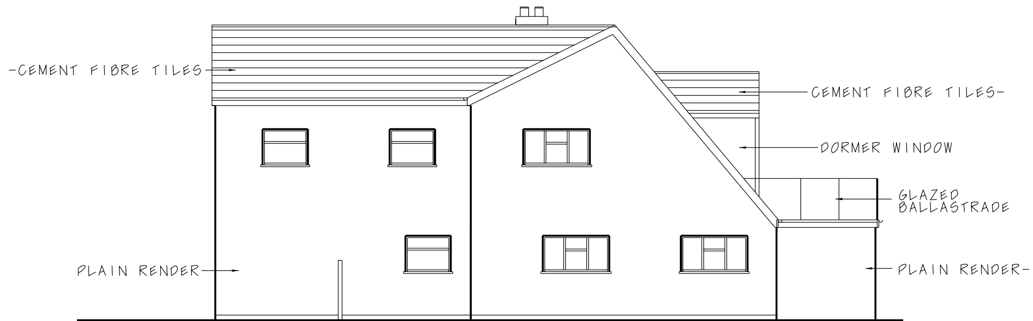
REAR • EAST • ELEVATION AS PROPOSED