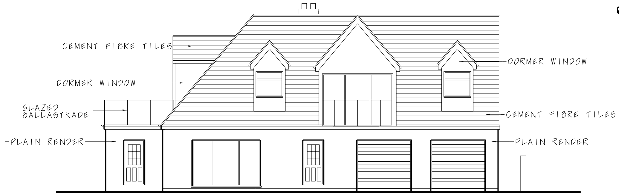
FRONT • WEST • ELEVATION AS PROPOSED