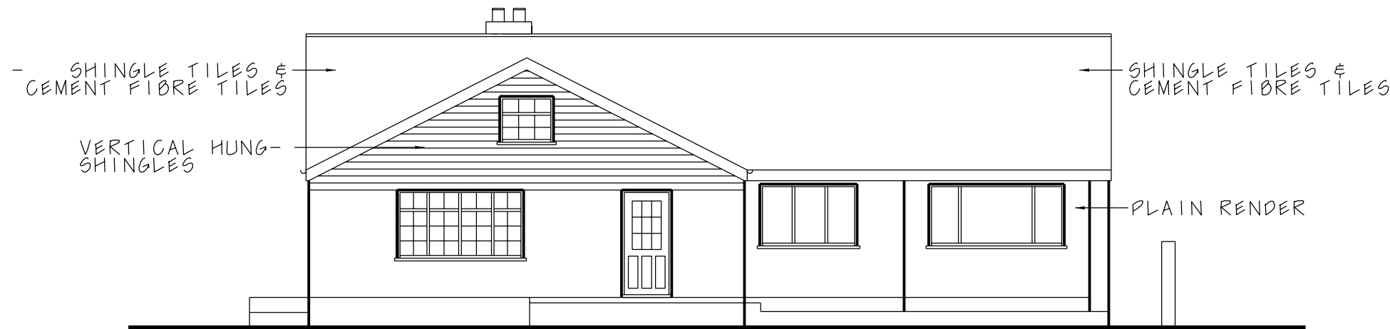
FRONT • WEST • ELEVATION AS EXISTING