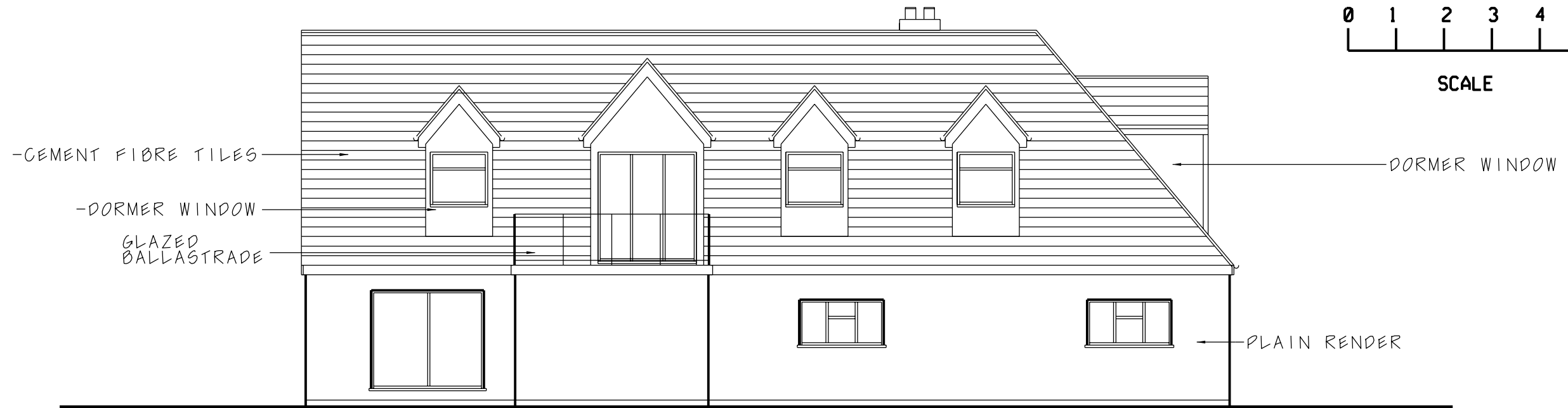
SIDE •NORTH•ELEVATION AS PROPOSED