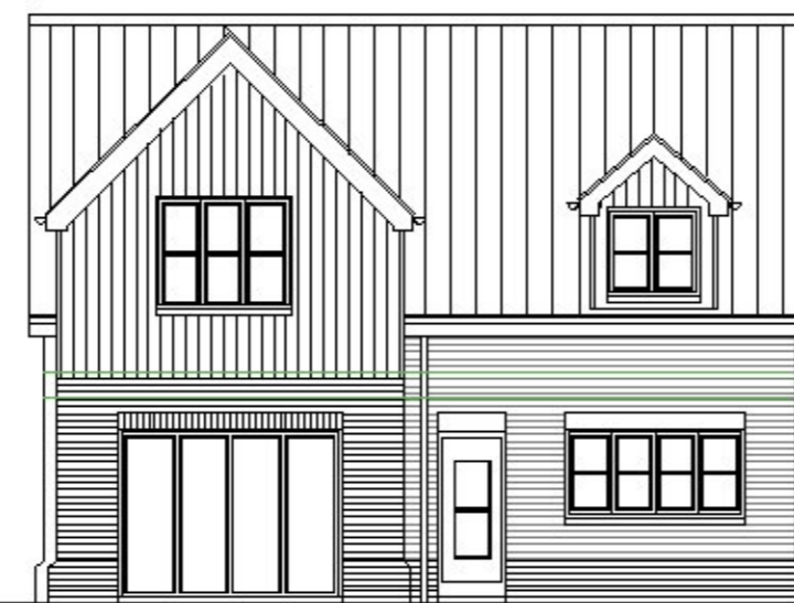
SOUTH FACING REAR ELEVATION