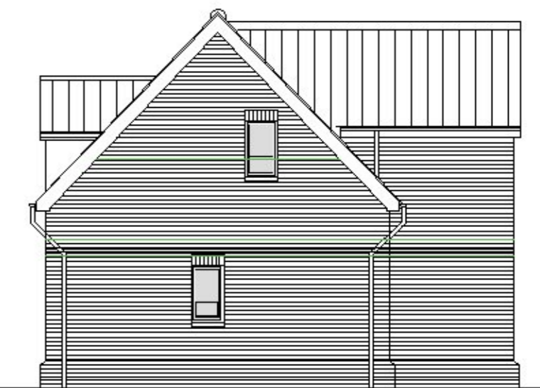
EXTERNAL SIDE ELEVATION

Materials Red stock brickwork with dark red engineering brick plinth, Western red cedar vertical cladding to dormers Concrete pantiles with concrete ridge to match White UPVC soffits and fascias Black UPVC downpipes and guttering Velux rooflights Doors and windows off white UPVC