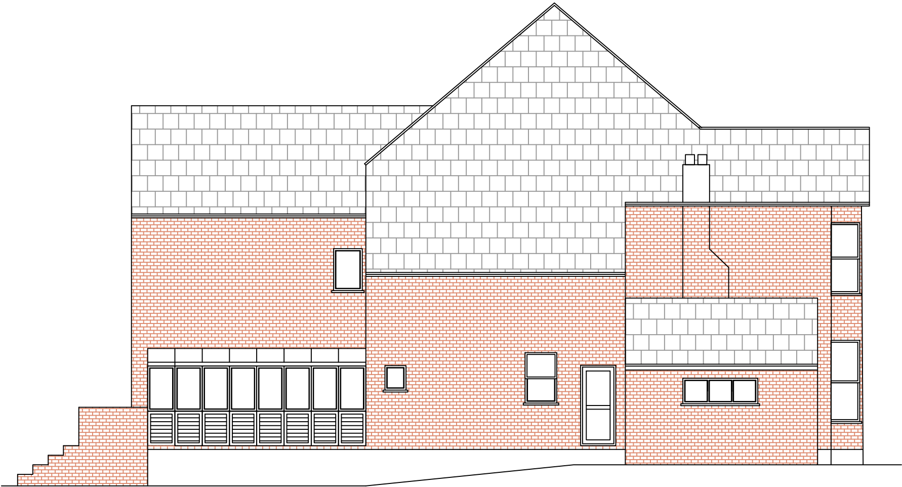
EXISTING LEFT SIDE ELEVATION

NOTES DRAWING SHOWING EXISTING AND PROPOSED LEFT SIDE ELEVATIONS