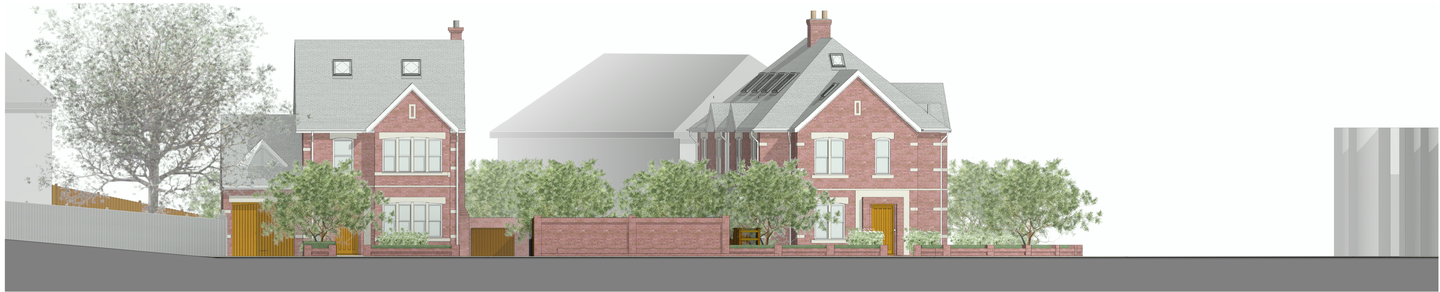
1 Street Scene St Leonards Road 1 : 100