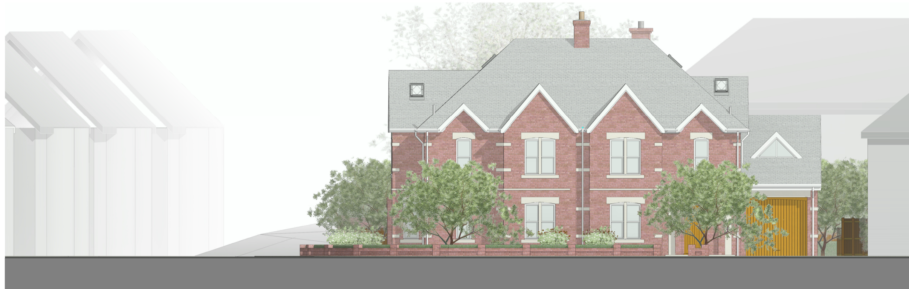
2 Street Scene Wharton Road 1 : 100