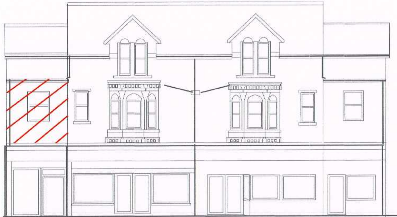
Proposed Front Elev Retrospective