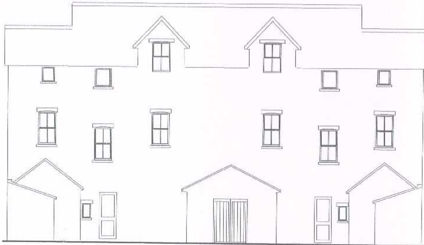
Existing Rear Elevation (No Change)