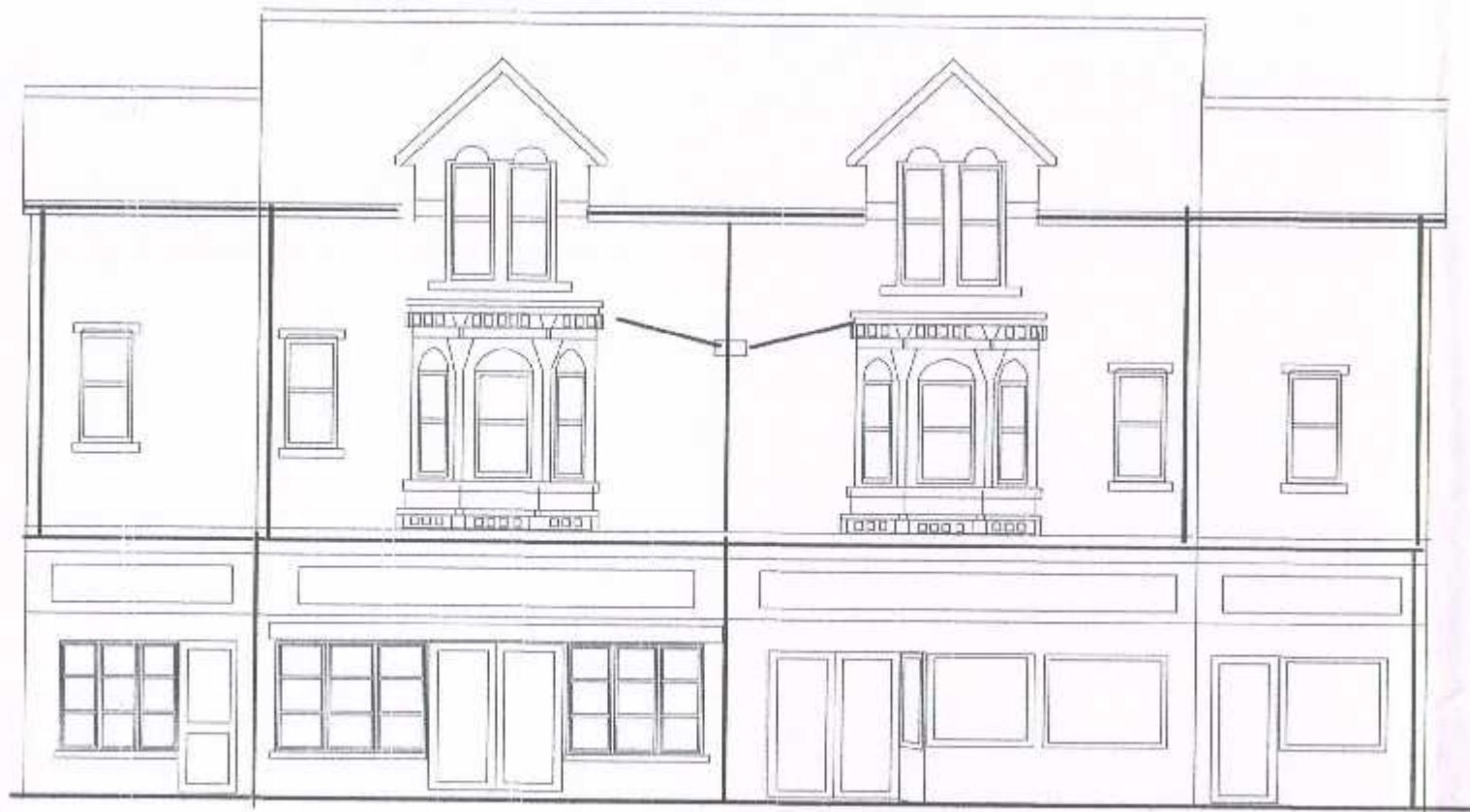
Existing Front Elev