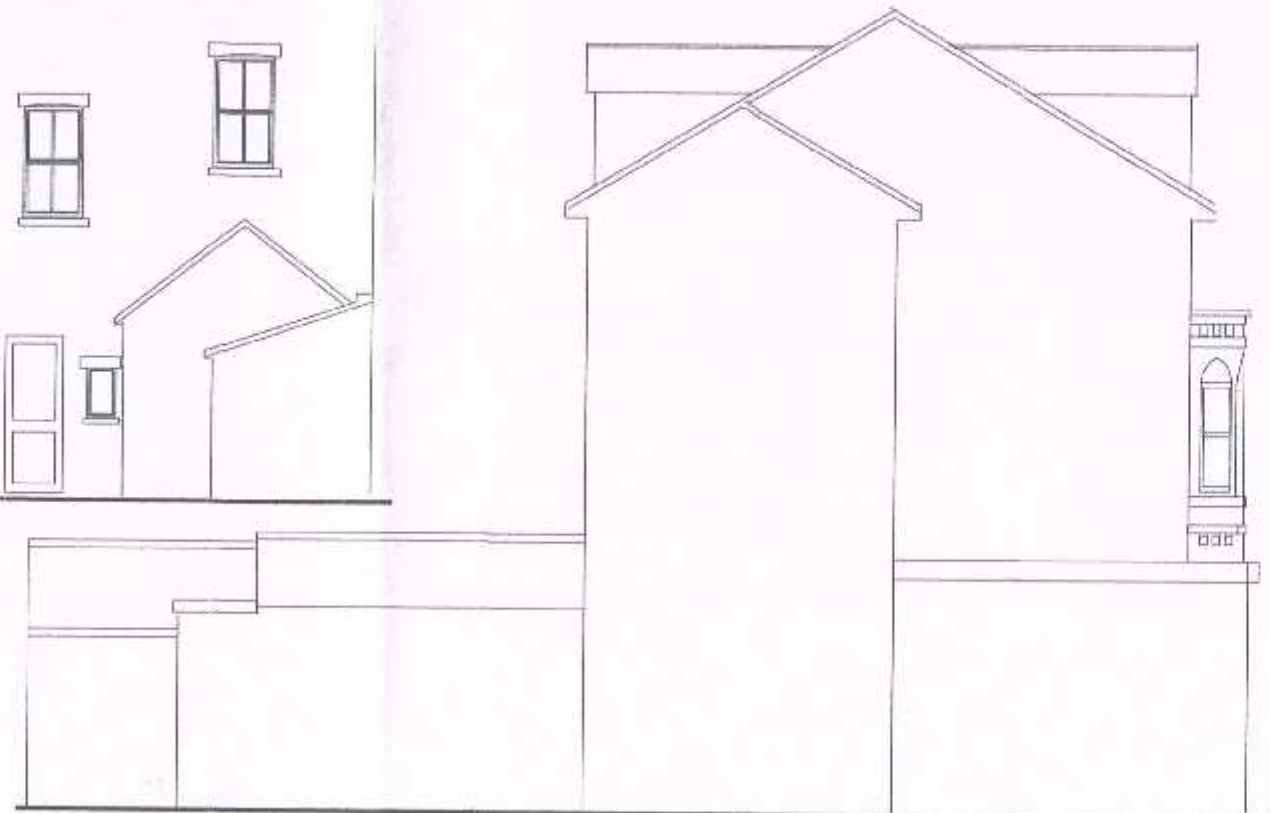
Existing Side Elev