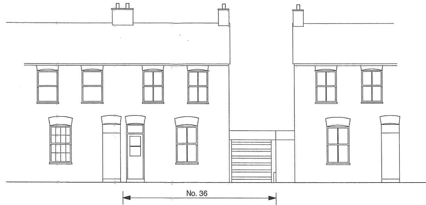
EXISTING FRONT ELEVATION (NORTH)