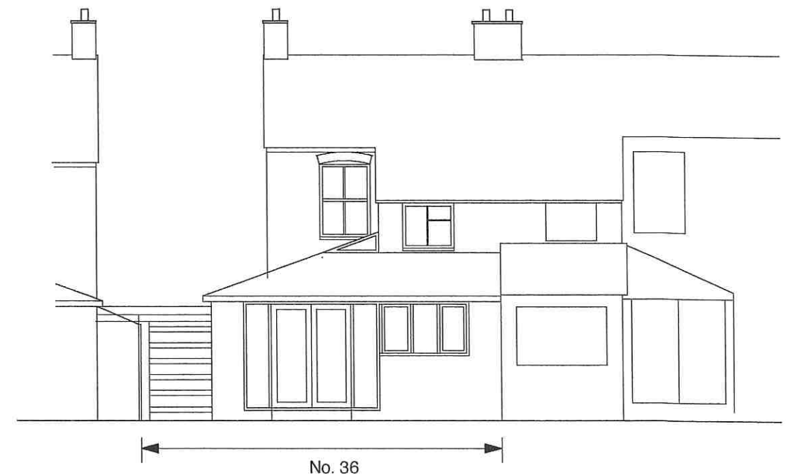
EXISTING REAR ELEVATION (SOUTH)