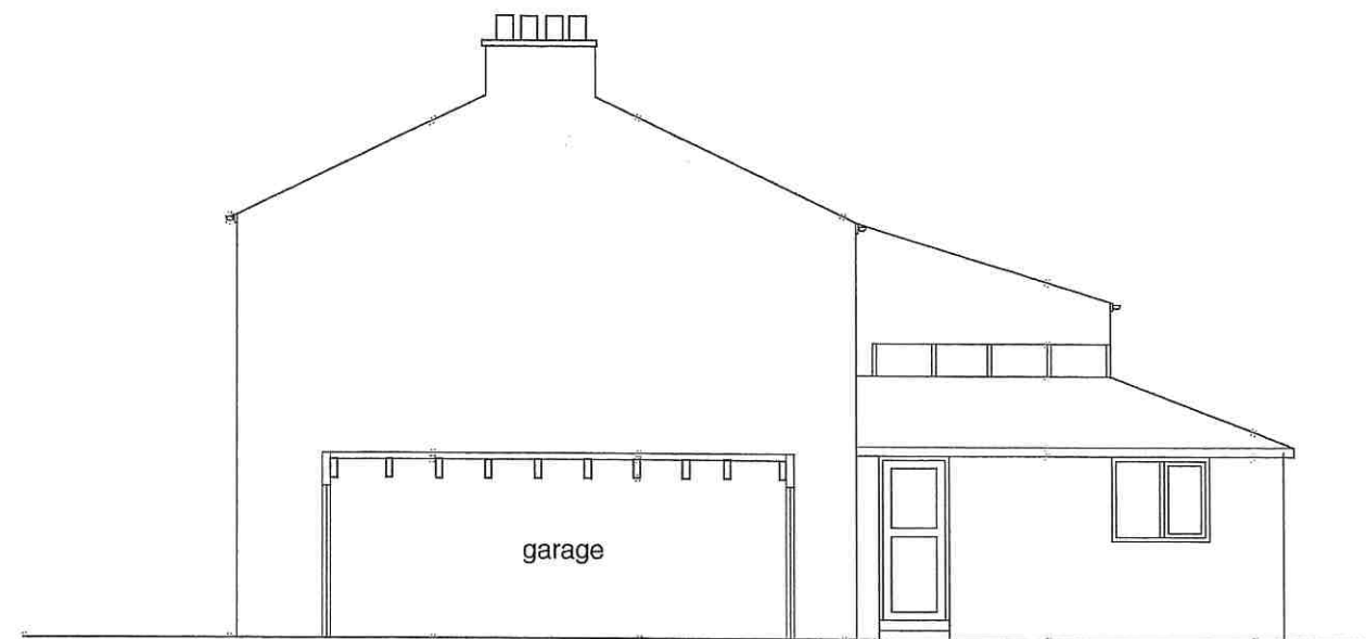
EXISTING SIDE ELEVATION (WEST)