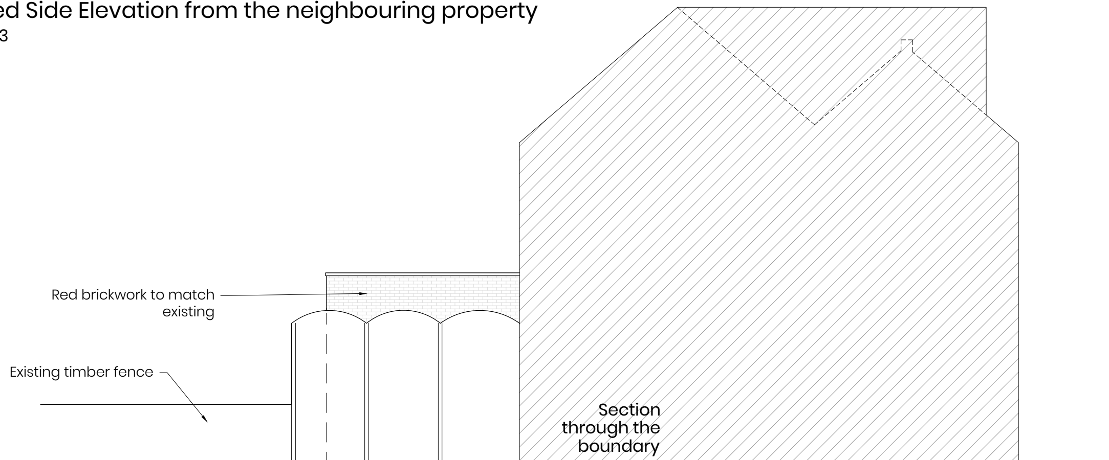
GA Proposed Side Elevation from the neighbouring property Scale 1:100 @ A3

This drawing is the property of "Studio Tashkeel Architecture Ltd." and copyright is reserved by them. The drawing is not to be copied or disclosed by or to any unauthorised persons without the prior written consent of Studio Tashkeel Architecture Ltd.