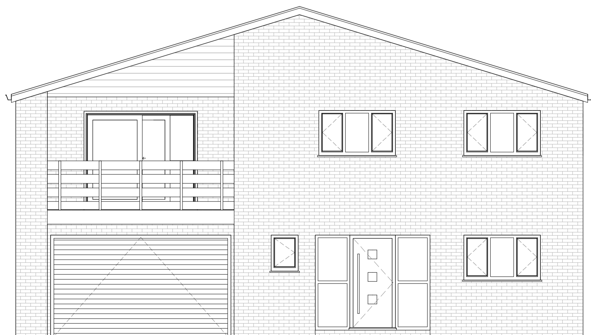
Existing Front Elevation 1 : 50