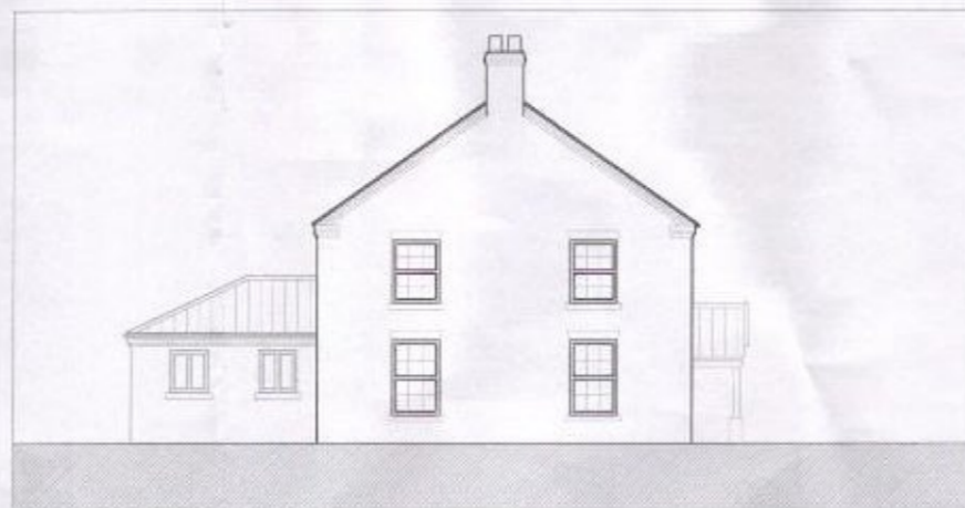
Proposed North-West Elevation 1:100

This copy has been made for use with the authority of the architect and is not to be used for any other purpose. It is not to be used for any other purpose. It is not to be used for any other purpose. It is not to be used for any other purpose.