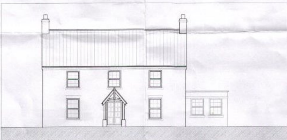
Proposed South-West Elevation 1:100