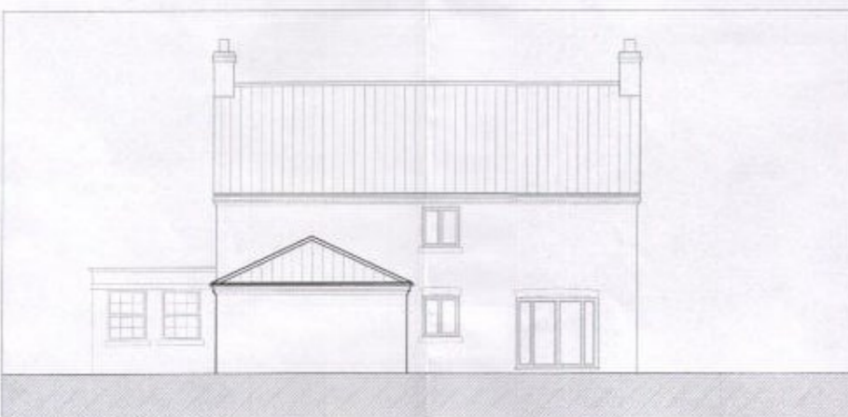
Proposed North-East Elevation 1:100