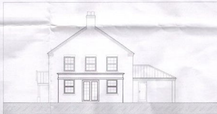
Proposed South-East Elevation 1:100