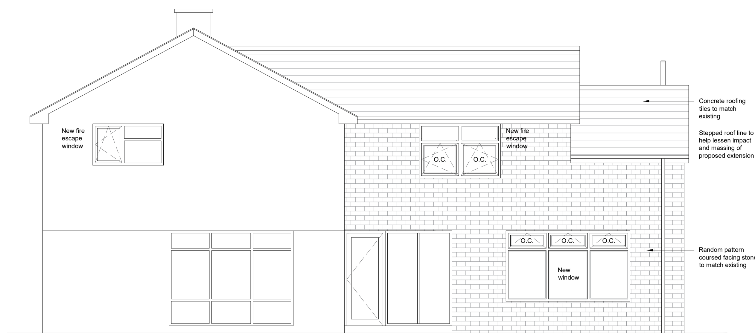
Front Elevation as Proposed