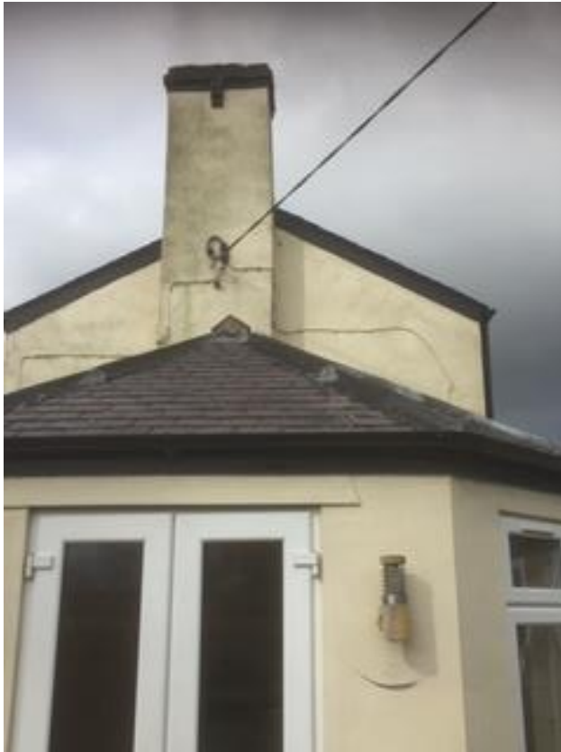
Existing slate roof over Garden Room where new roof to extension will be joined