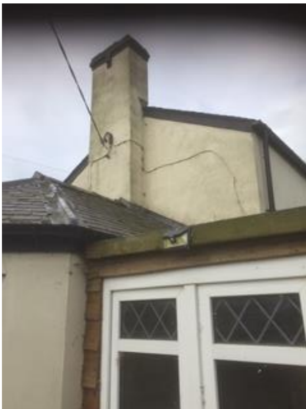
Junction of existing flat roof to be removed with Garden Room slate roof