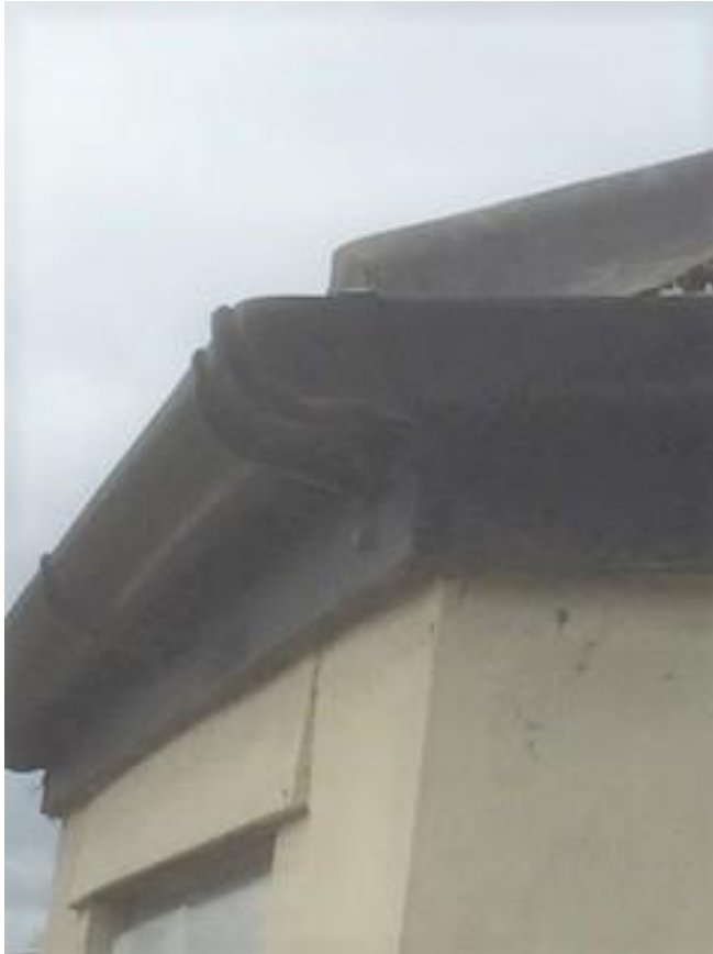
Existing Eaves Detail to Garden Room