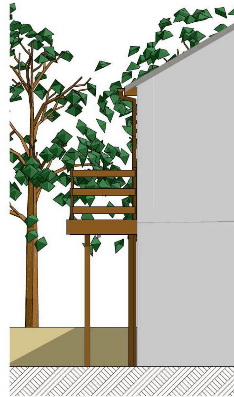
E-18 North Elevation 1:50