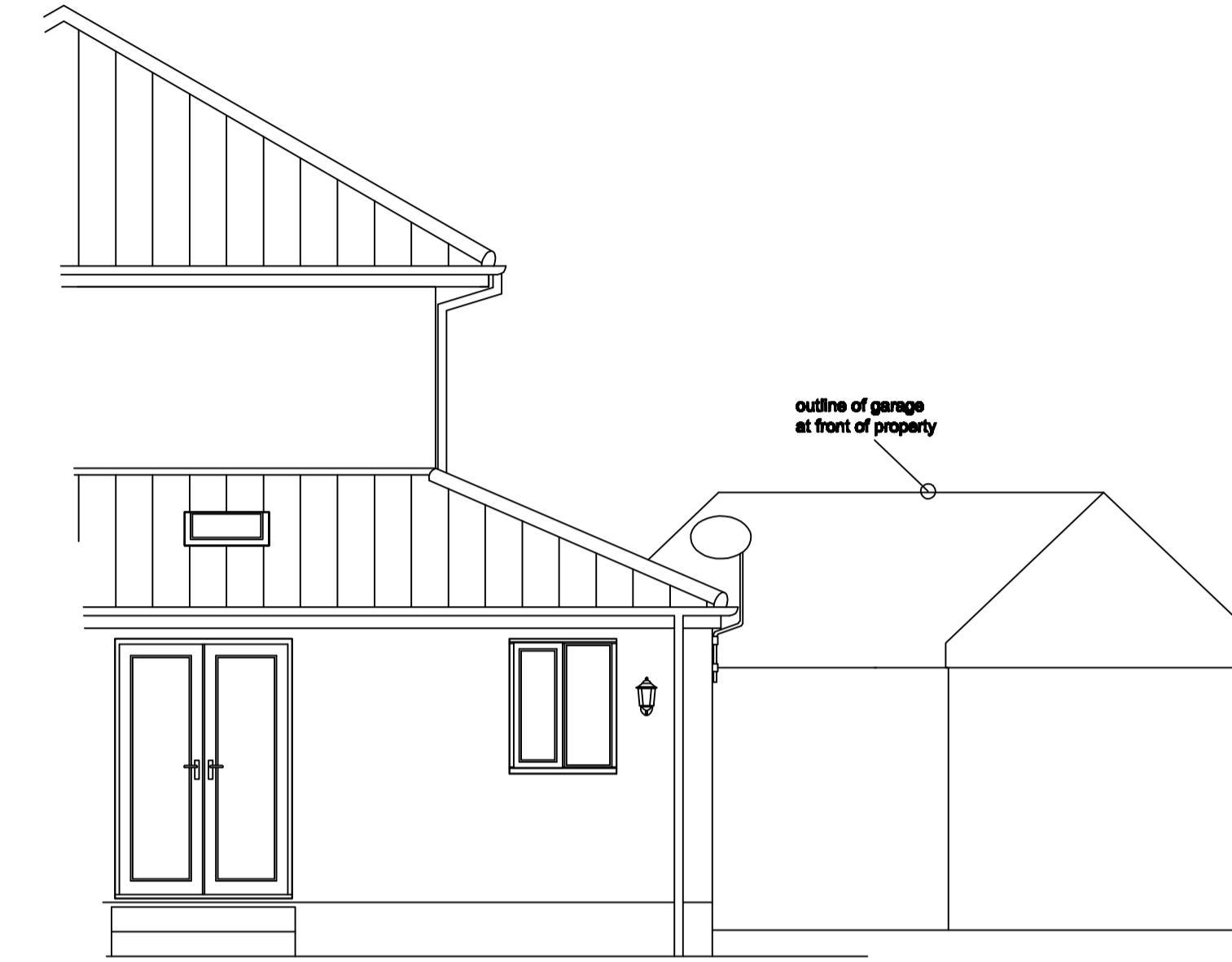
Partial rear elevation