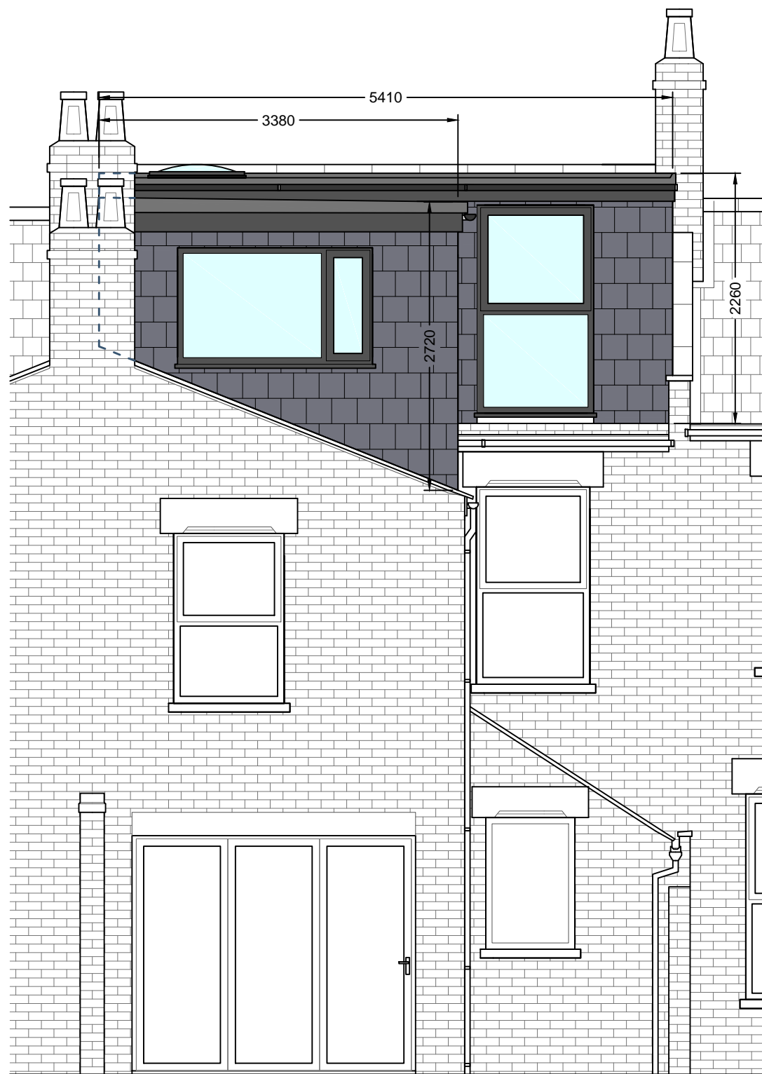
E PROPOSED REAR ELEVATION 06 SCALE 1/50