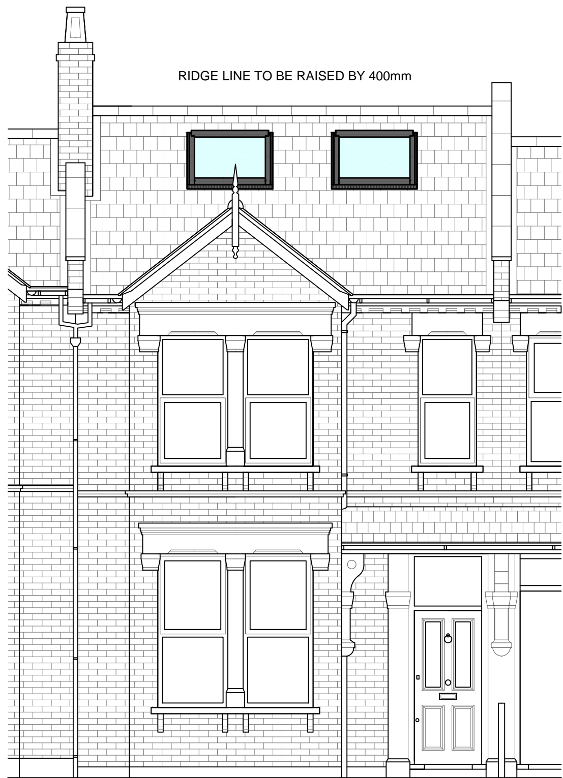
E PROPOSED FRONT ELEVATION 05 SCALE 1/50