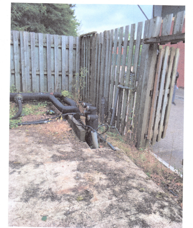
EXISTING CONCRETE SLAB