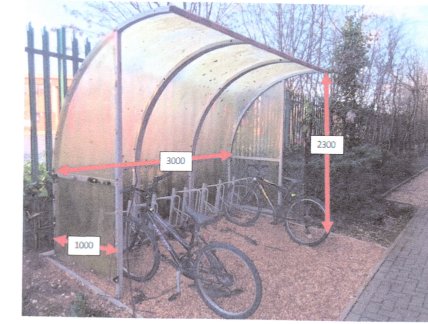
EXISTING CYCLE SHELTER TO BE RE-USED FOR SMOKING SHELTER