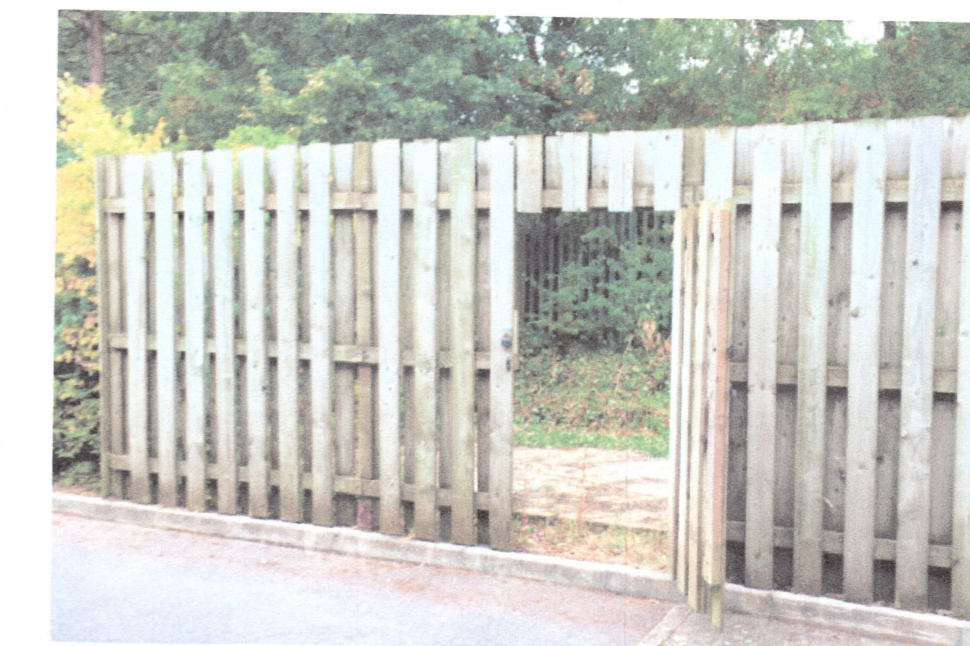
EXISTING 'HIT & MISS' FENCING