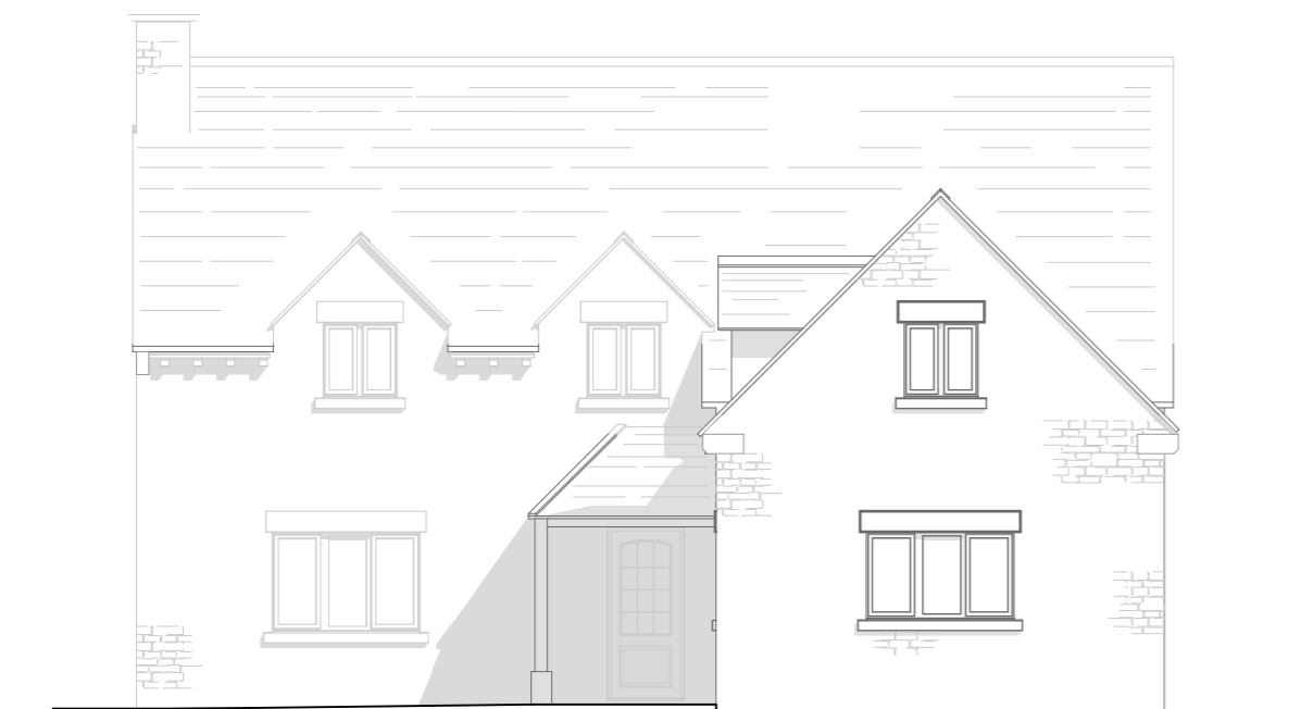
South Elevation - Existing

Notes This document and its design content is copyright ©. It shall be read in conjunction with all other associated project information including models, specifications, schedules and related consultants documents. Do not scale from documents. All dimensions to be checked on site. Immediately report any discrepancies, errors or omissions on this document to the Originator. If in doubt ASK.