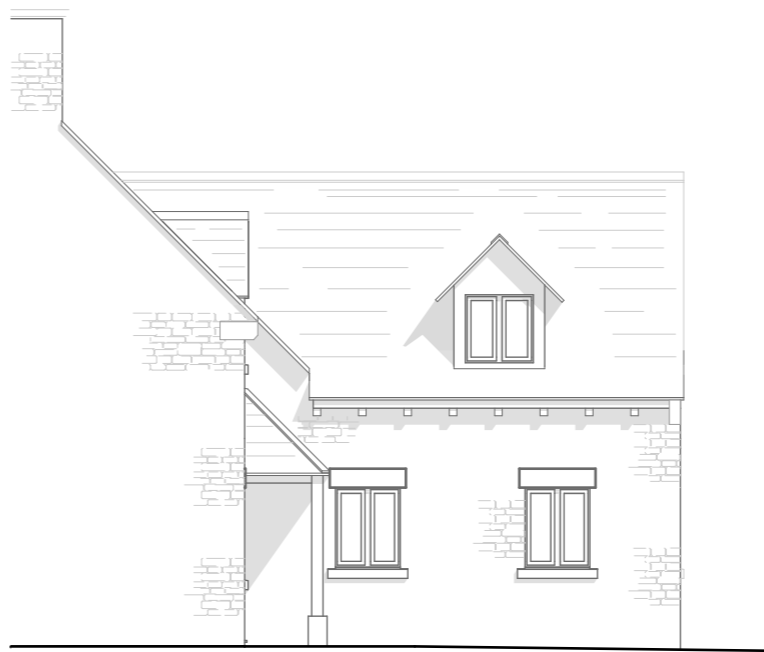
West Elevation - Existing