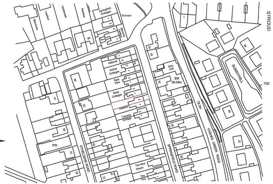
Location Plan Plan - scale 1:1250

Hi-Lite Windows Ltd 5 Lansdown Stroud Gloucestershire, GL5 1BB