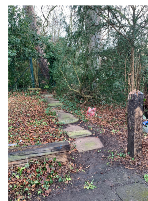
VIEW 3 - EXISTING STEPS TO GATE