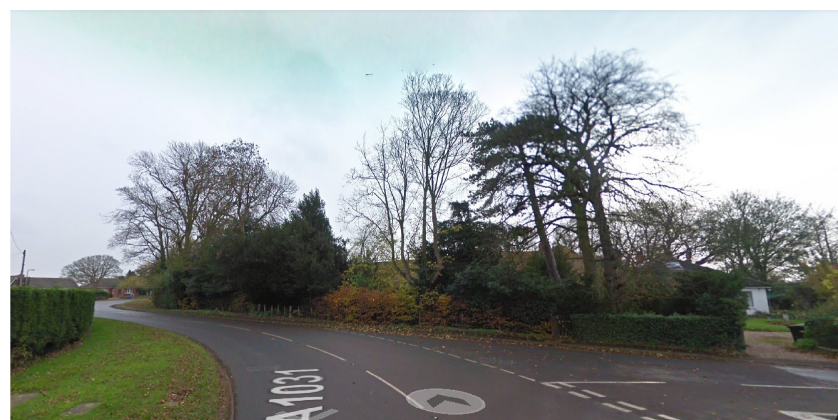
VIEW 1 - EXISTING FRONTAGE LOOKING EAST ALONG SEA DYKE WAY