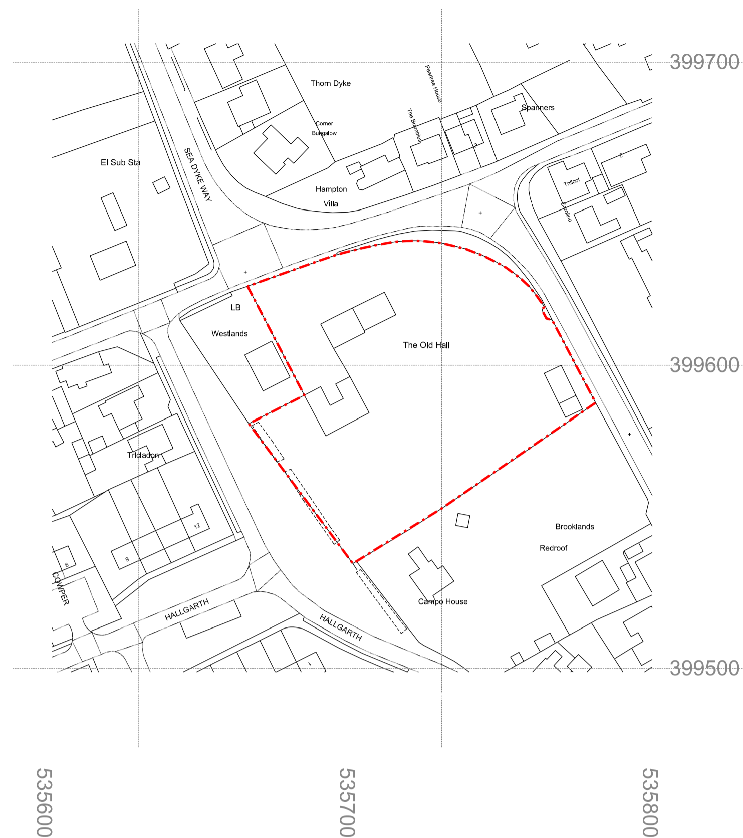
01 LOCATION PLAN SCALE 1:1250