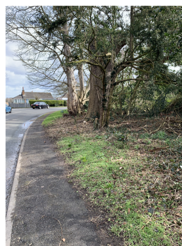
VIEW 2 - EXISTING EMBANKMENT