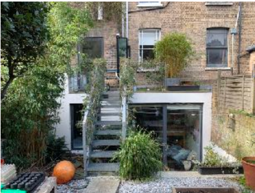
Rear of 12B Approach Road looking North-West.

The high quality materials and design of the Mökki Quad Compact building will compliment the existing building, for example the metal door and large glass windows will echo the features of our extension (see below) and the wooded cladding is typically of garden structures in general.