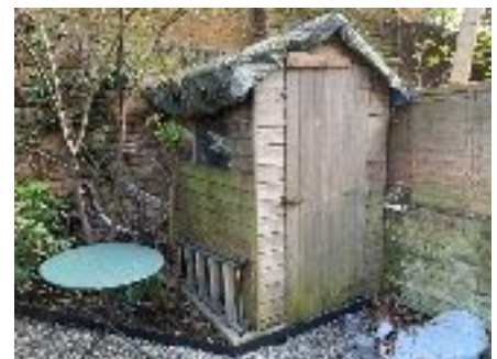
The existing she in situ.

The proposal is to remove the existing garden shed and replace it with a more substantial garden room. The new garden room, while still being relatively modest, will be large enough to use as an additional home office / homework area / hobby area, as well as storing garden tools and the like.