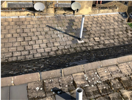
EXISTING: roof tiles to be reuse if possible