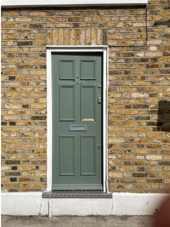
EXISTING: 74A Barnet Grove Entrance door opening to be converted in window. Ref bricks to be matched.