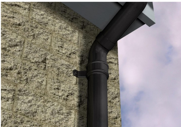
SAMPLE: Standard circular downpipe black aluminium