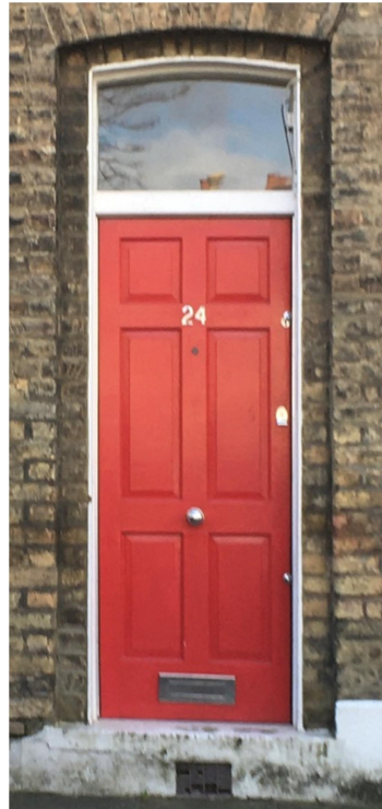
REFERENCE: Main entrance door in the neighbourhood.