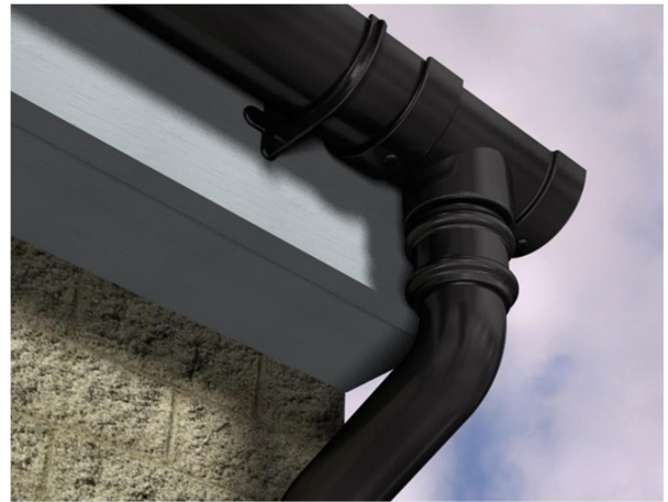
SAMPLE: Half round gutter system black aluminium