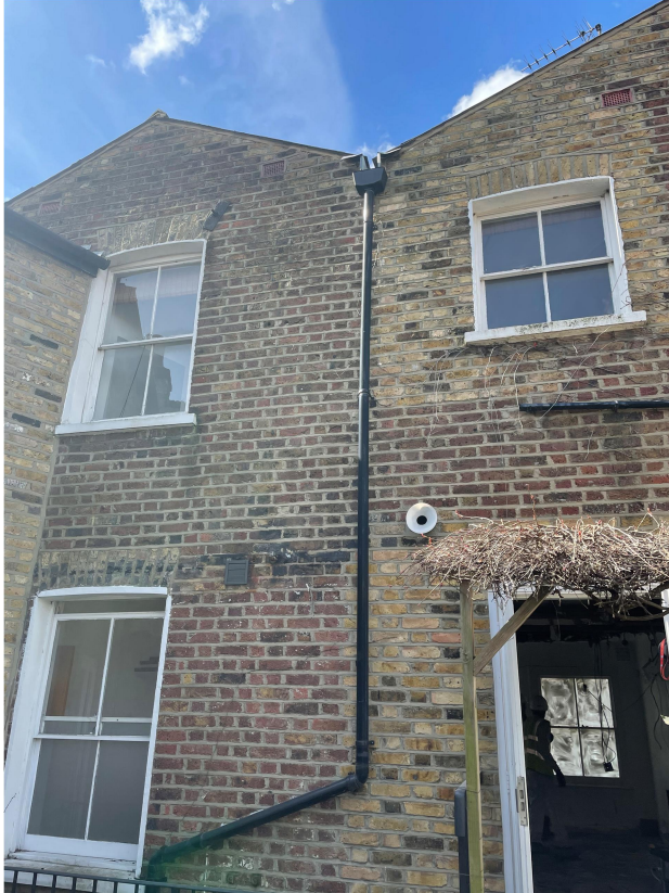
EXISTING: Black aluminium rainwater goods