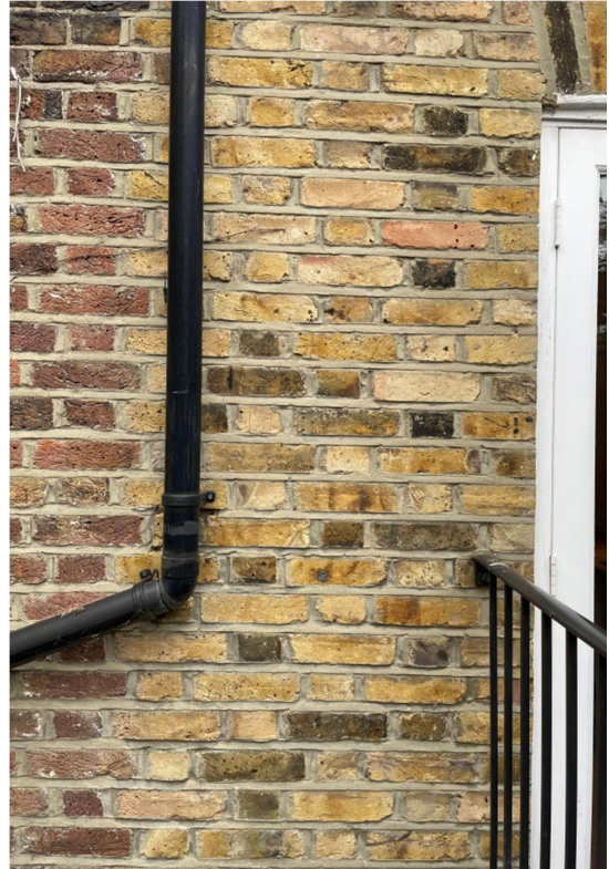
SAMPLE: 74 Barnet Grove rear elevation bricks to be reused for the external wall.