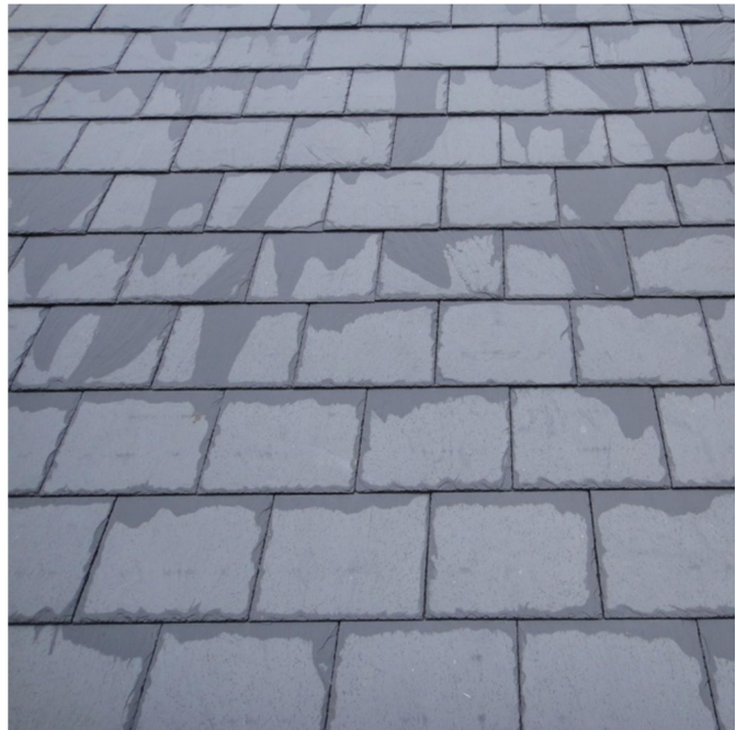
SAMPLE: Natural slate tiles to match the existing