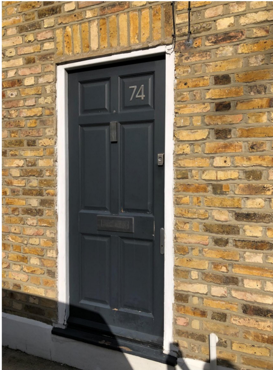
EXISTING: 74 Barnet Grove Entrance door .