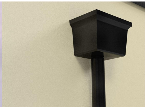
SAMPLE: Standard hopper black aluminium