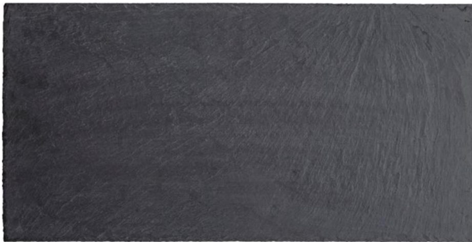
SAMPLE: Natural slate tiles to match the existing dimensions