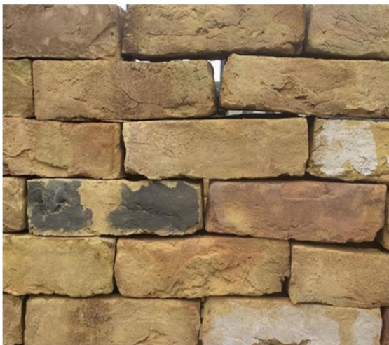
SAMPLE: Imperial weathered original London stock bricks.