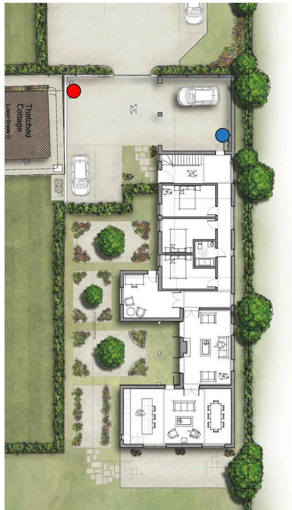
Approved Site Plan Scale - 1:200