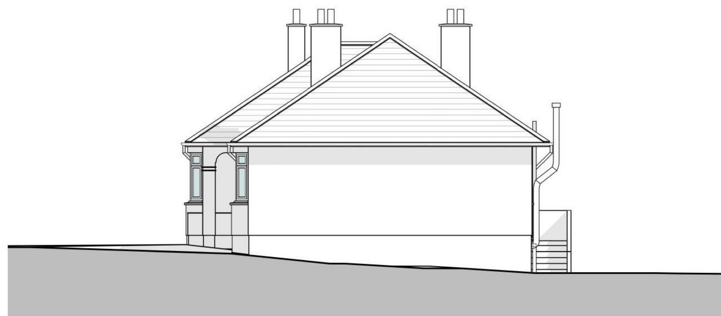
Existing West Elevation 1 : 100