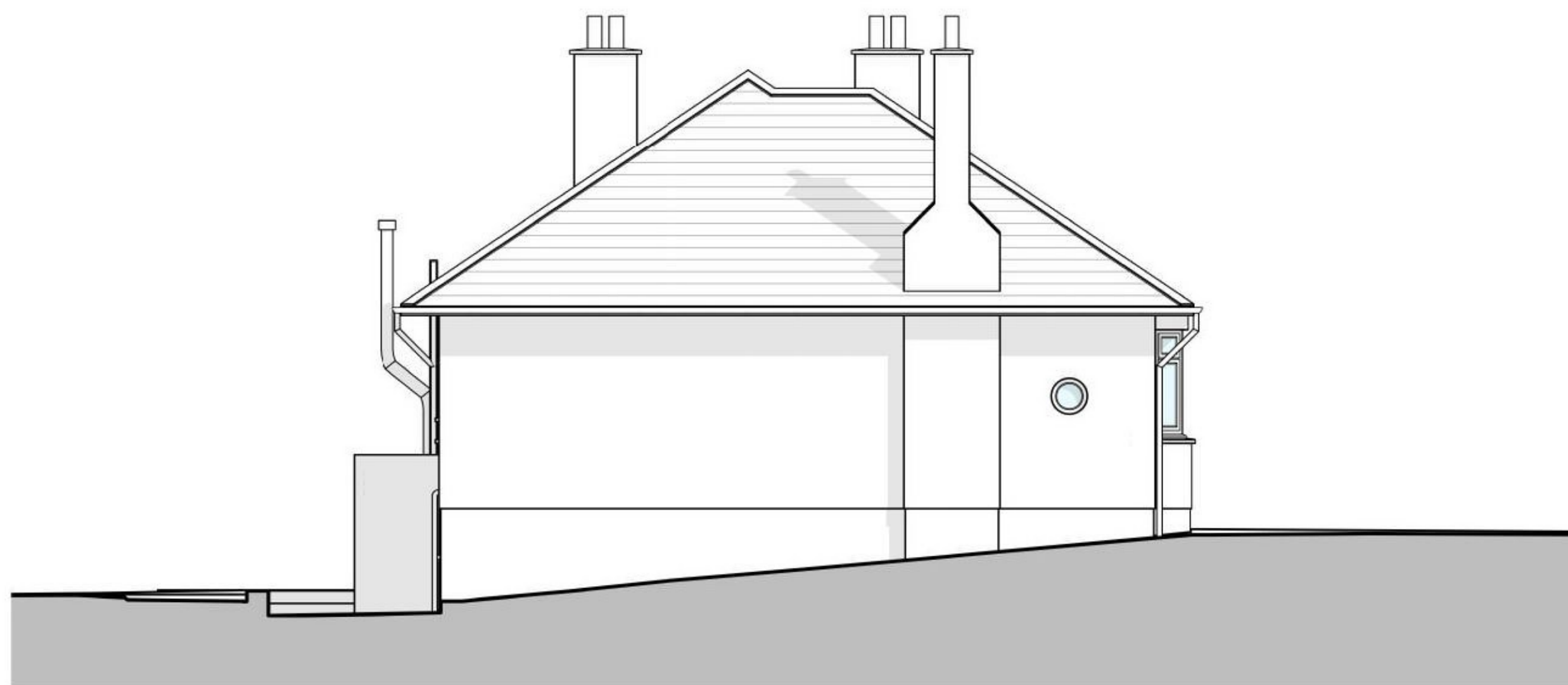
Existing East Elevation 1 : 100