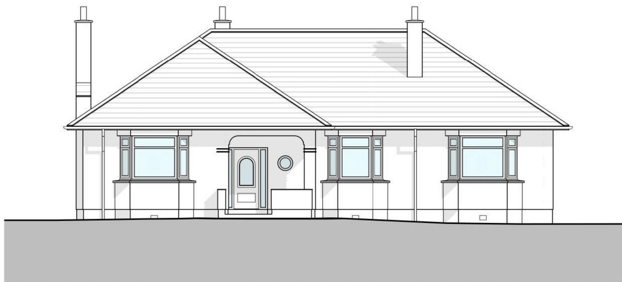
Existing North Elevation 1 : 100