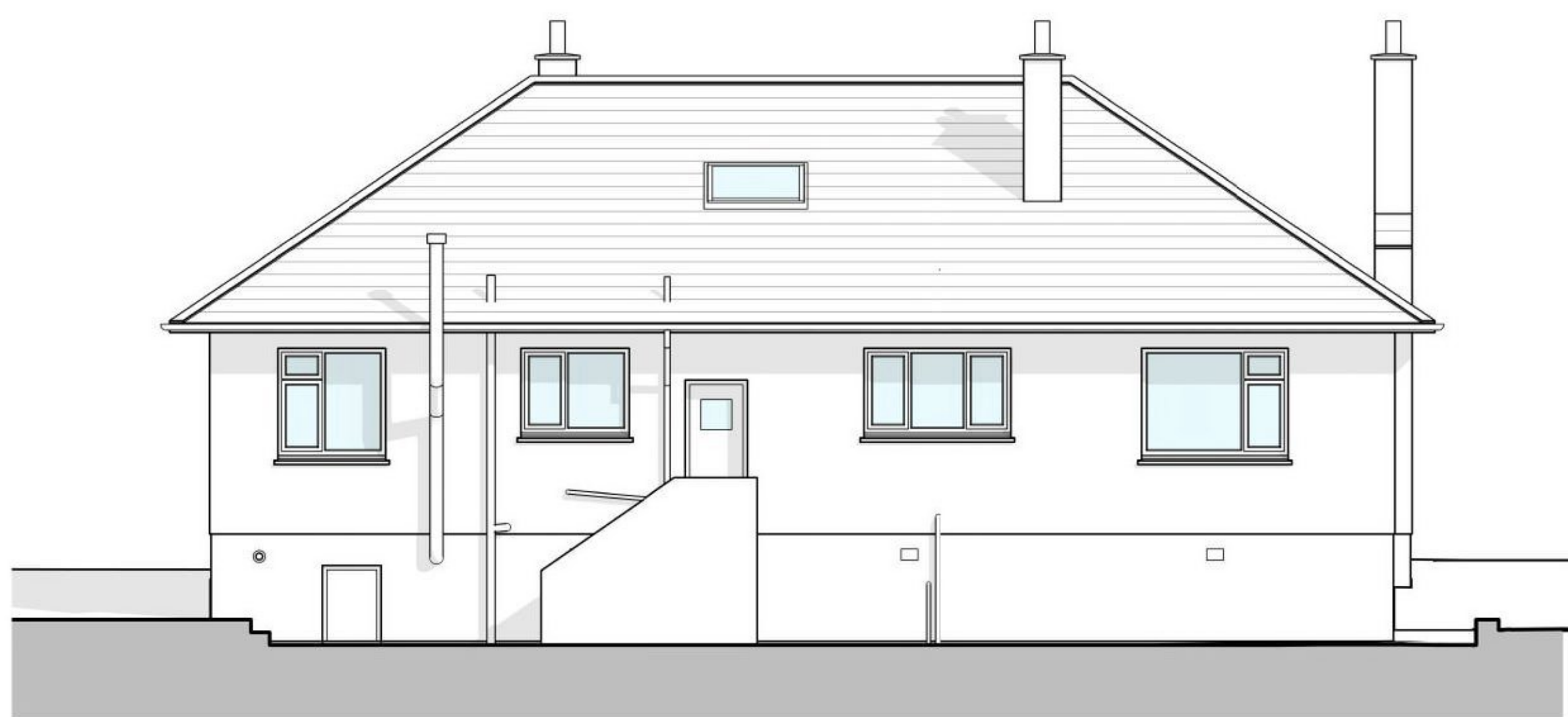
Existing South Elevation 1 : 100