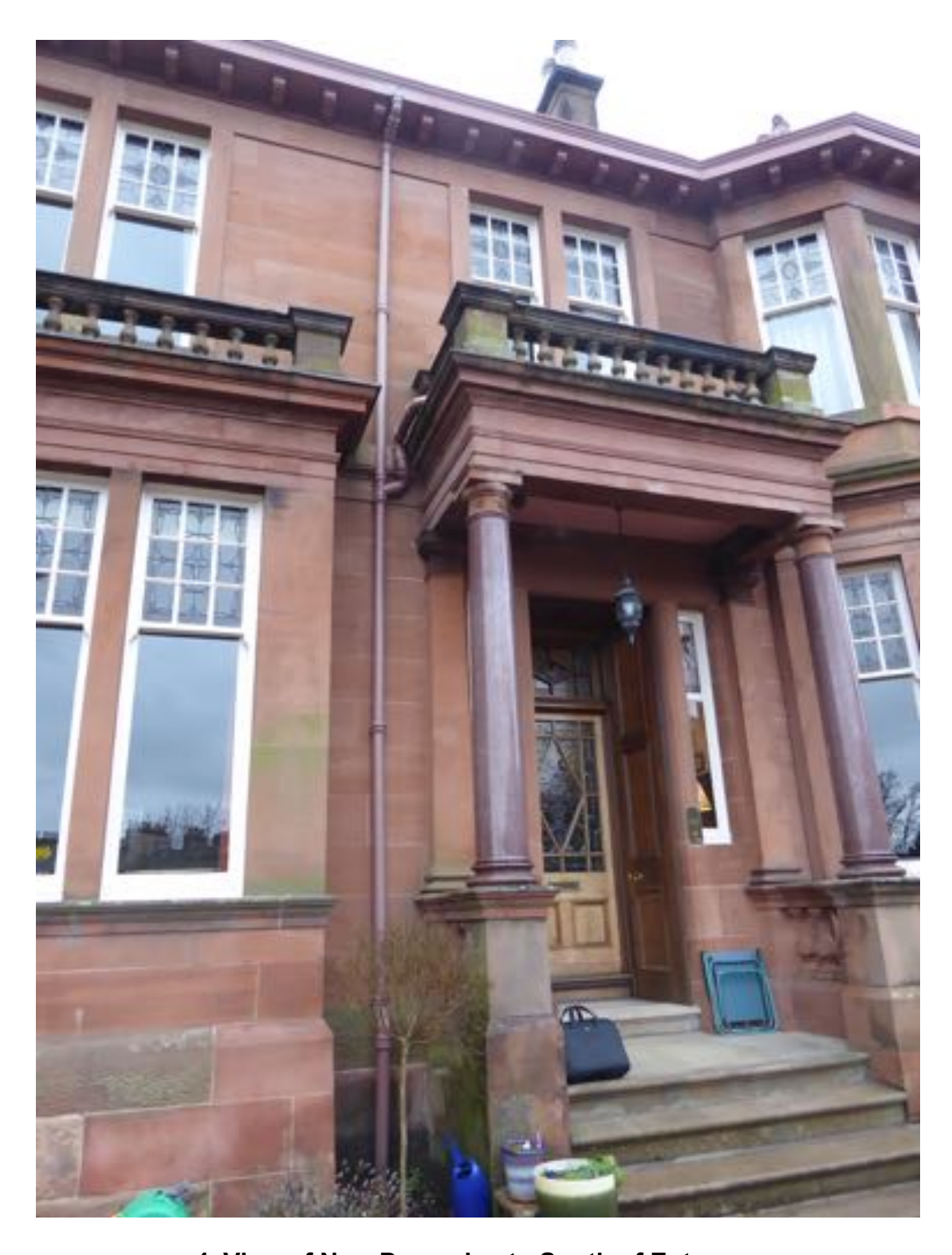
4. View of New Downpipe to South of Entrance