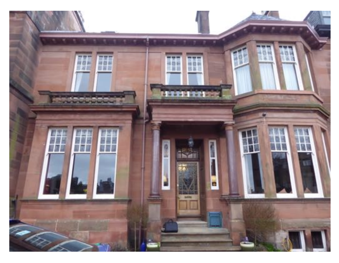
2. View of East Elevation from East