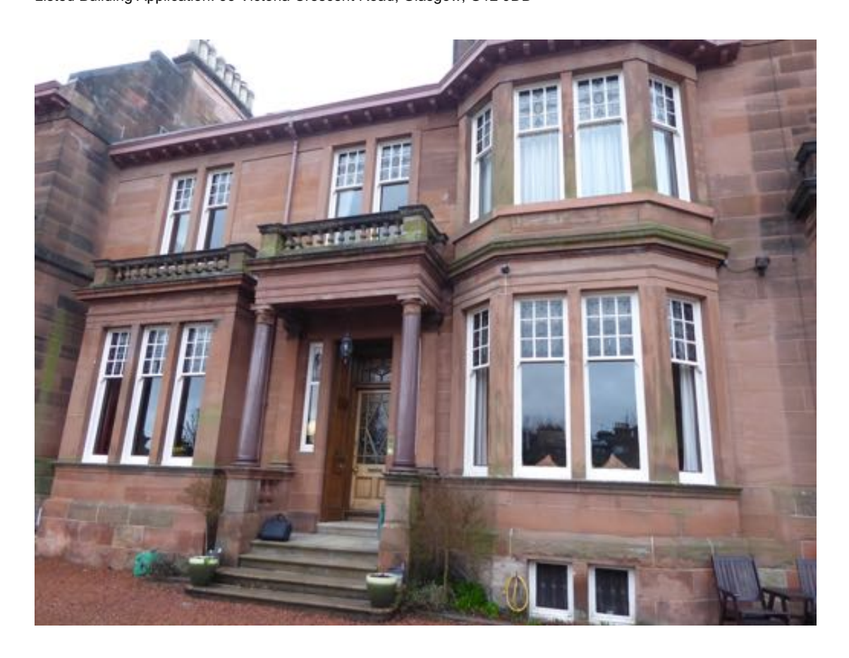
1. View of East Elevation from Northeast