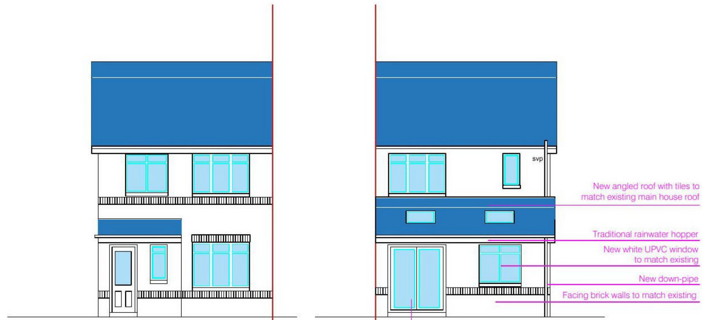
Front Elevation (no Change)