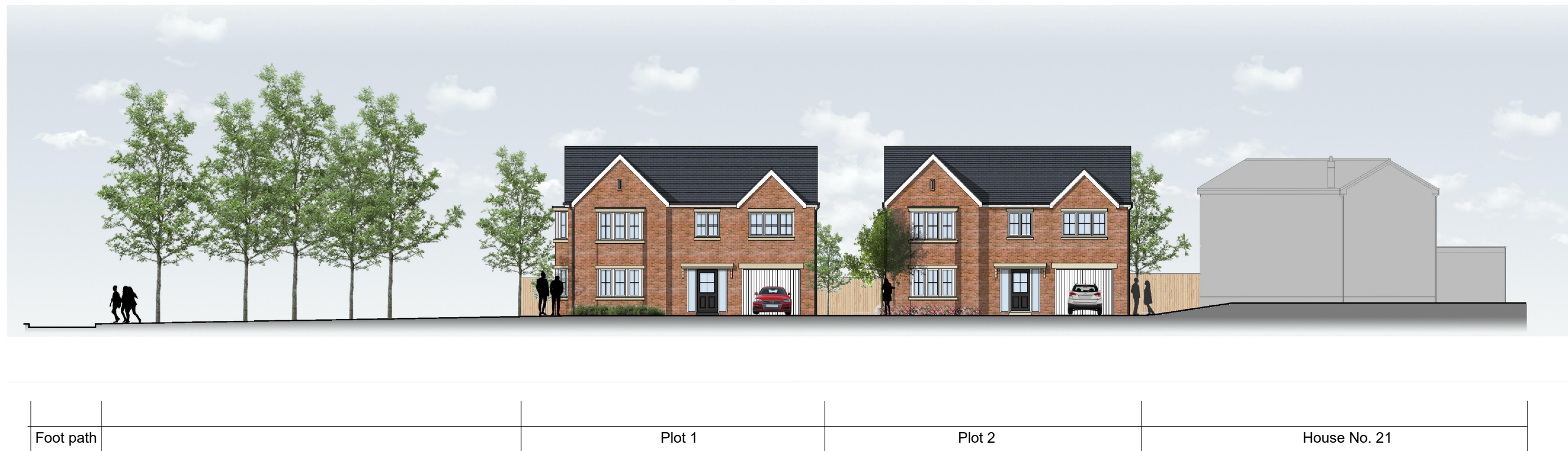
Street Scene BB