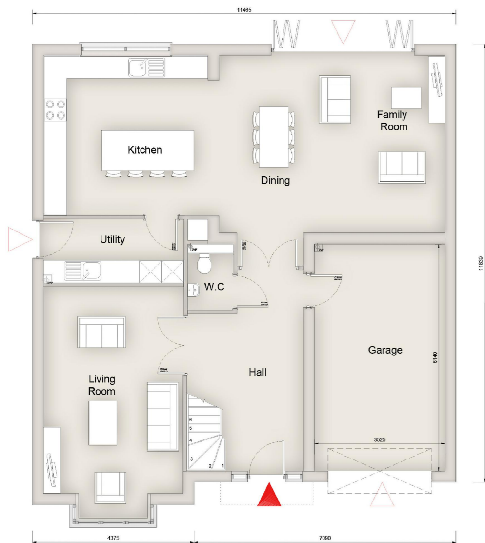
Proposed GF Plan