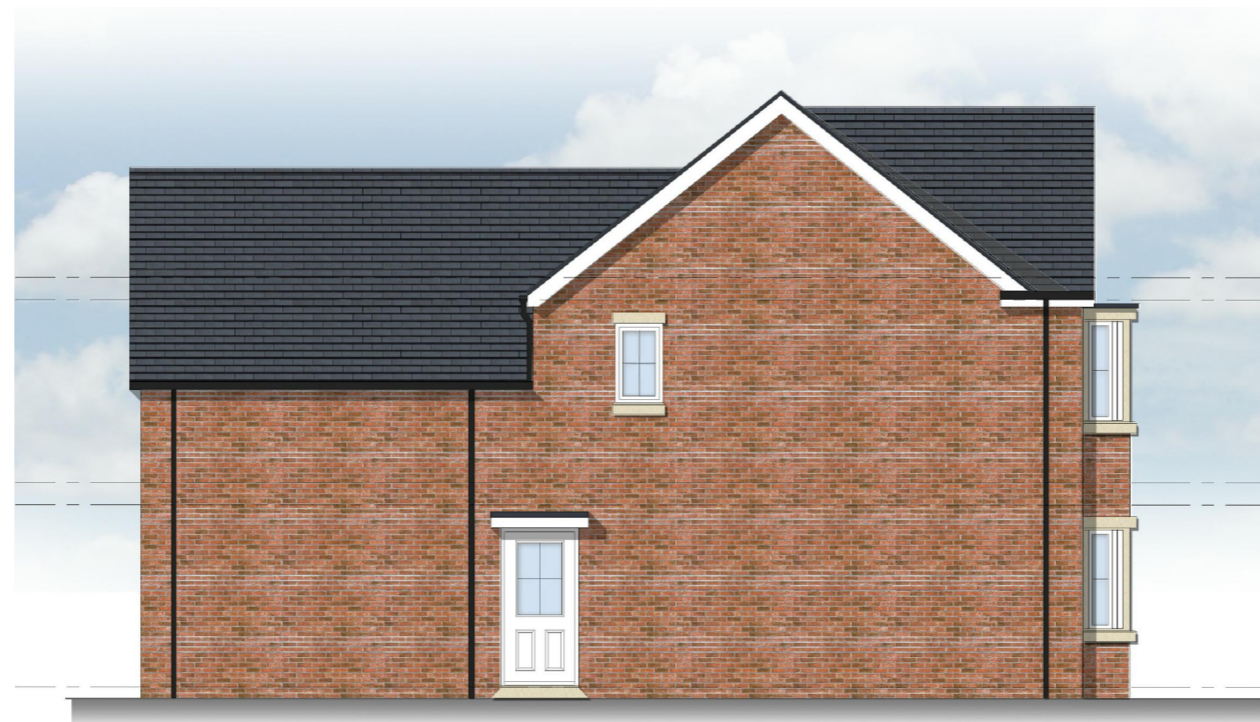
Proposed Side 01 Elevation