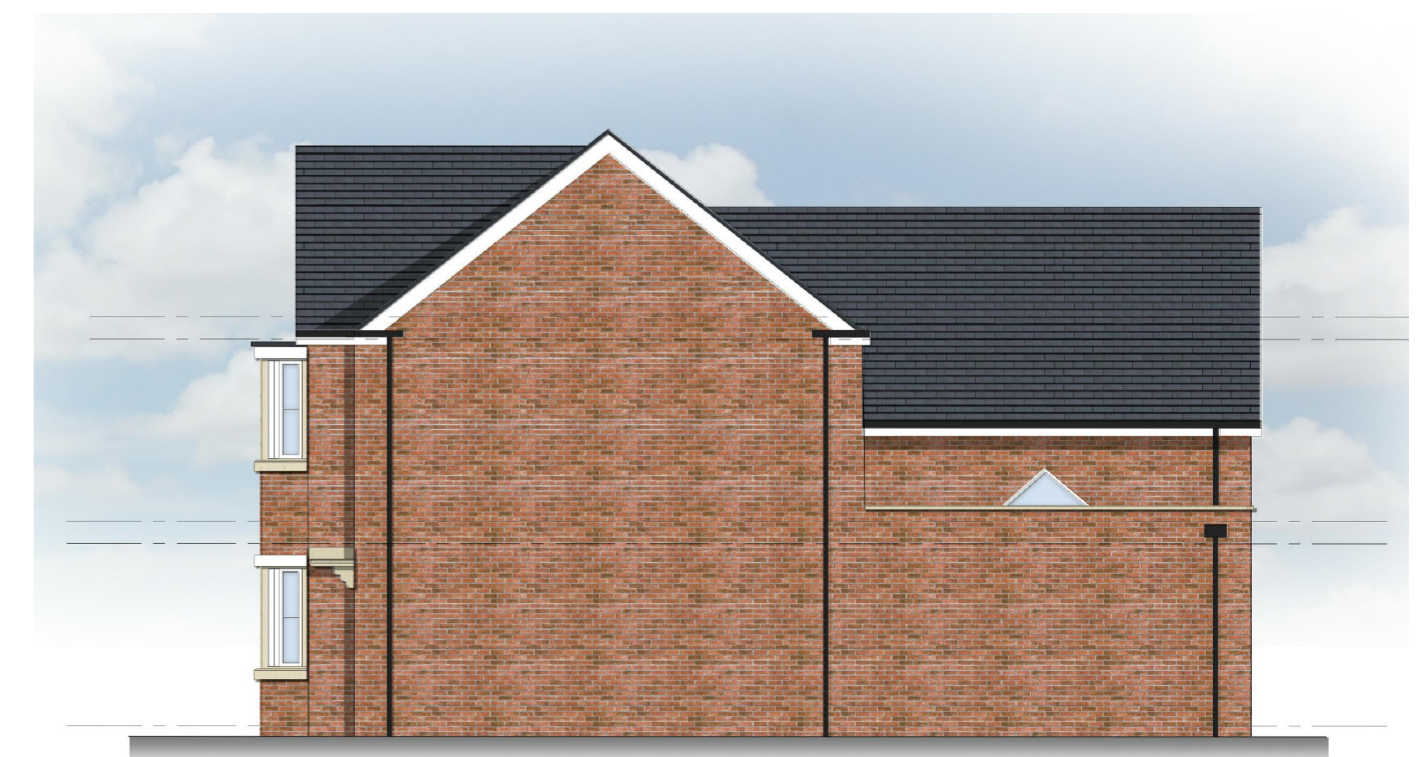
Proposed Side 02 Elevation