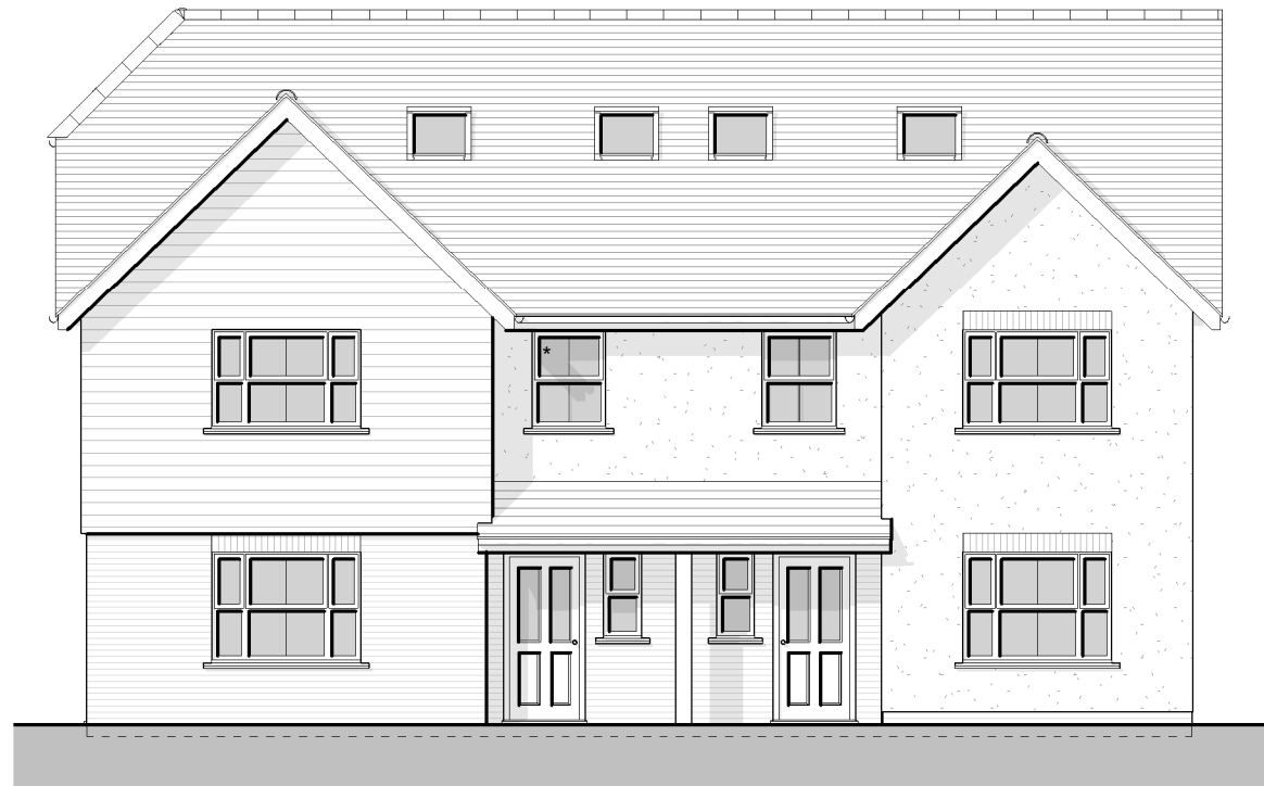
Plot 5 Front Elevation