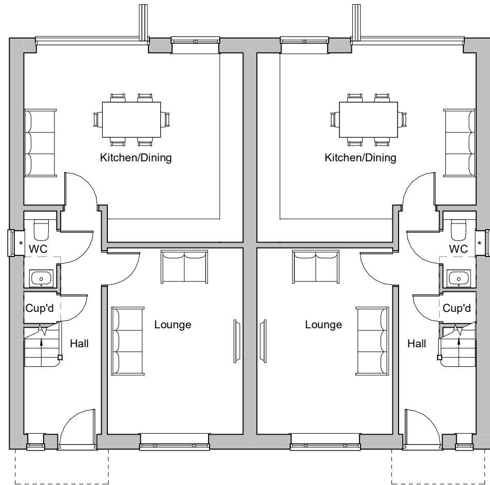
Plot 4 Ground Floor Plan