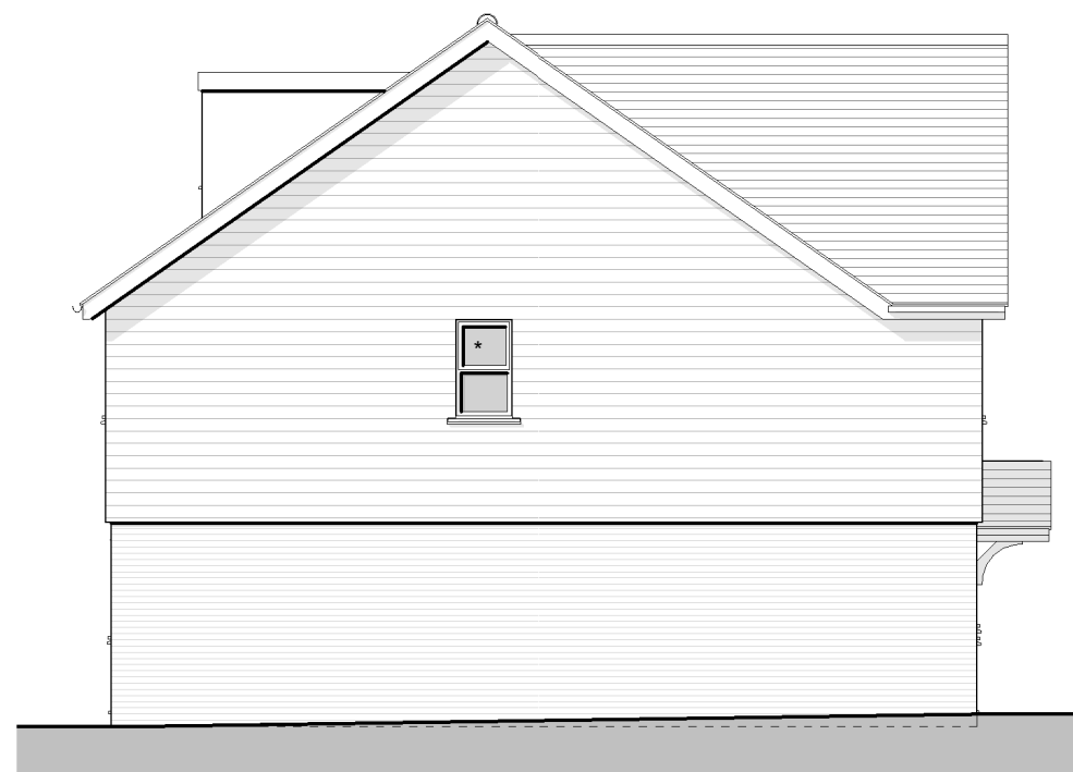
Plot 2 Left Elevation