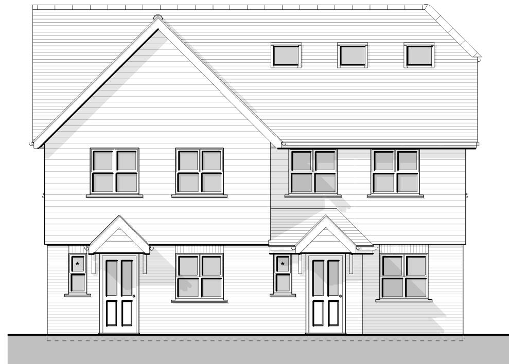
Plot 2 Front Elevation

8 Gateway 1000, Whittle Way, Stevenage, Hertfordshire, SG1 2FP