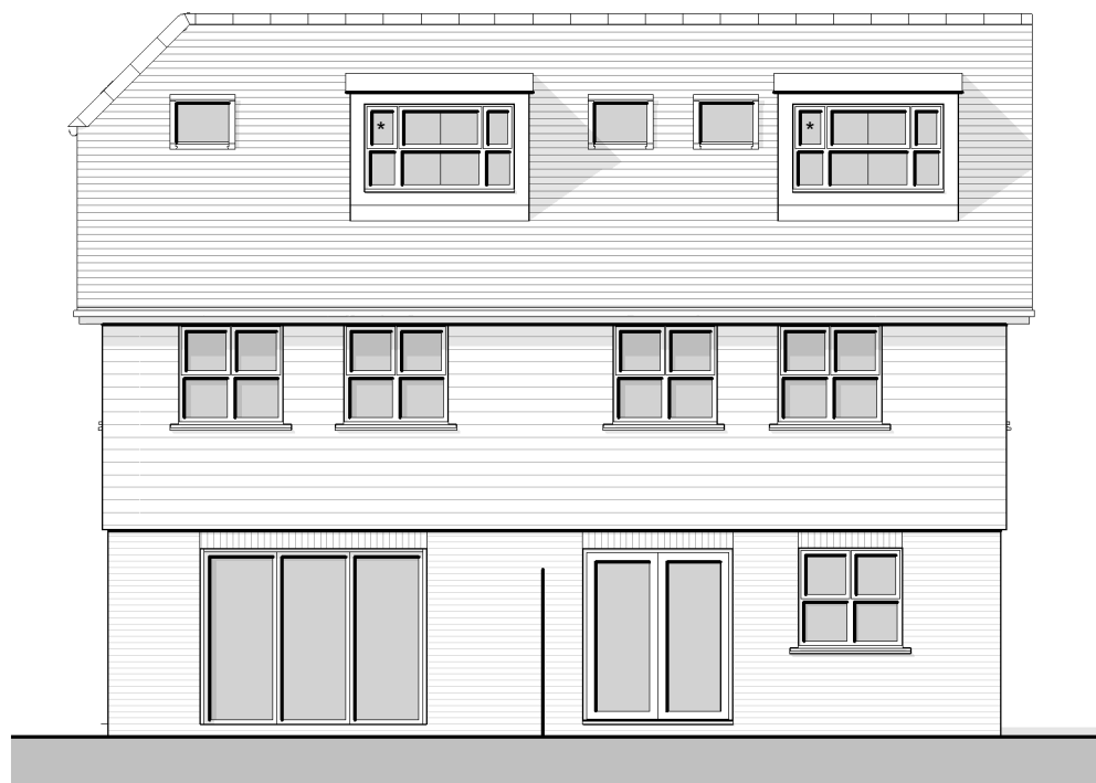
Plot 1 Rear Elevation