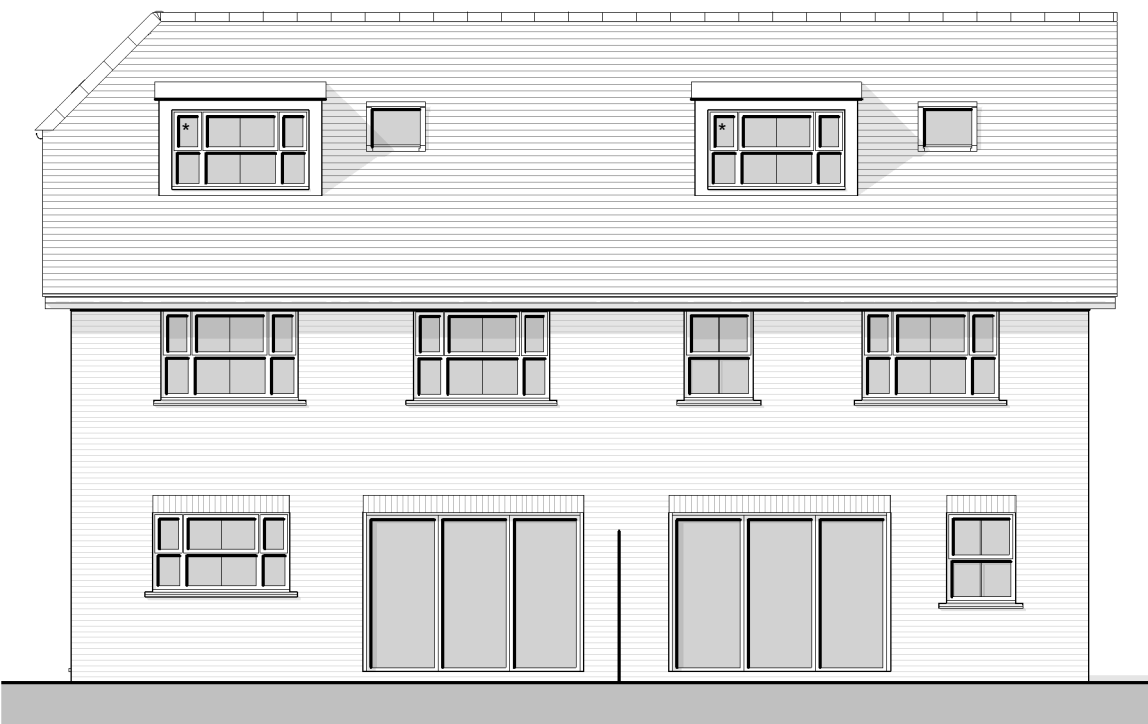
Plot 8 Plot 7 Rear Elevation