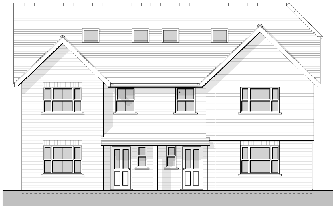
Plot 7 Plot 8 Front Elevation