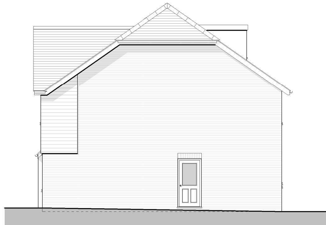
Plot 8 Right Elevation