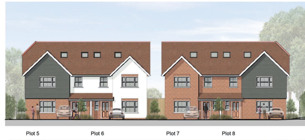
Proposed Rear Street Scene (Plots 5-8)