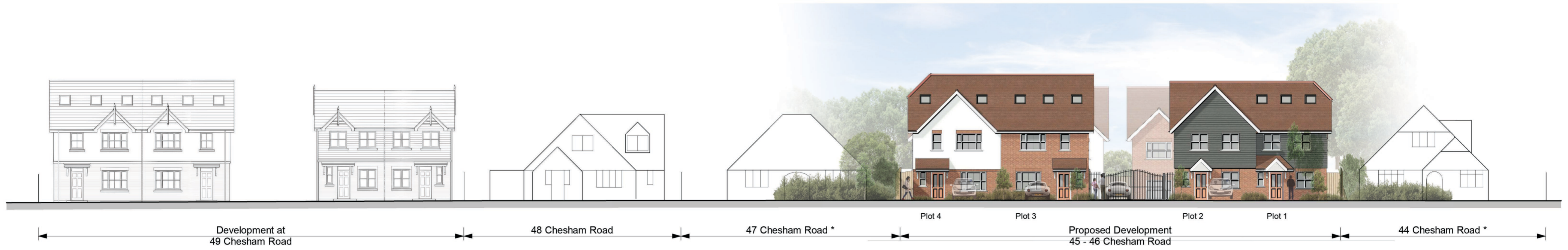
Proposed Chesham Road Street Scene