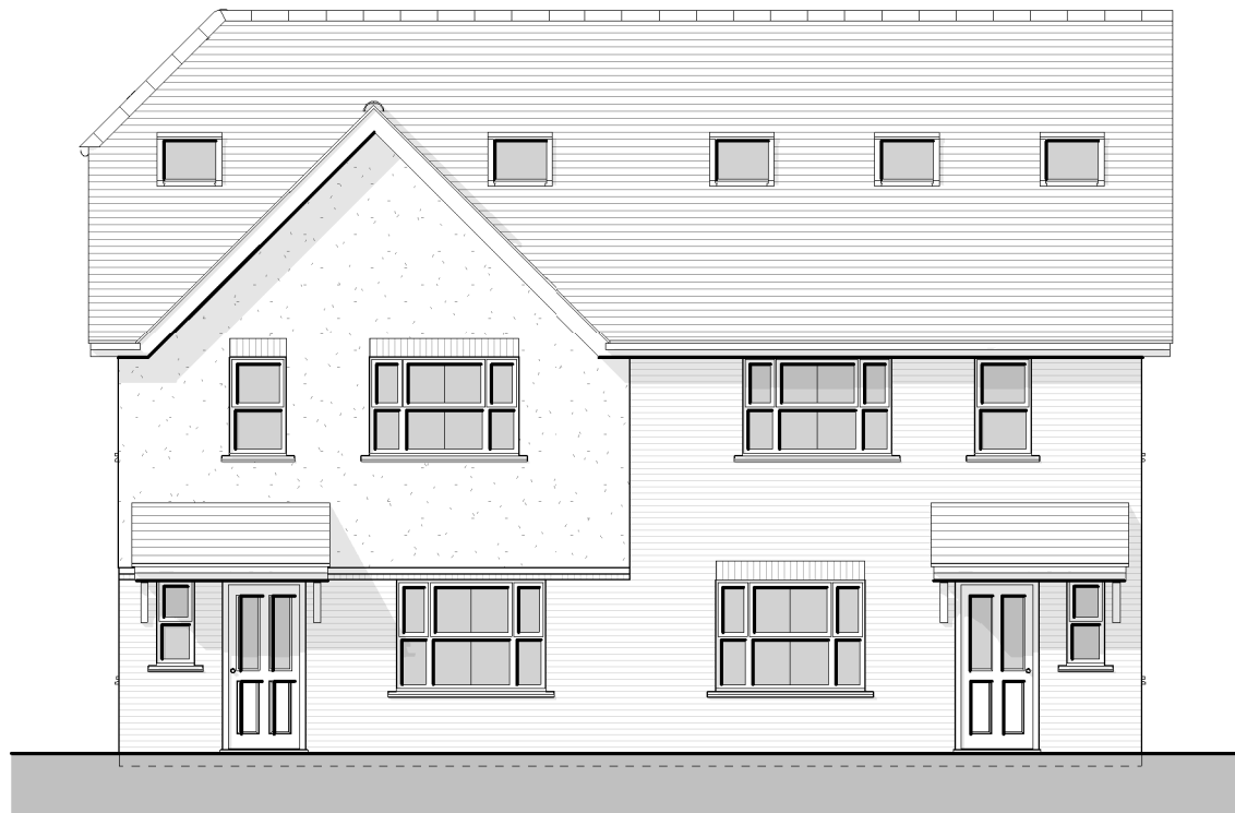
Plot 4 Plot 3 Front Elevation

8 Gateway 1000, Whittle Way, Stevenage, Hertfordshire, SG1 2FP