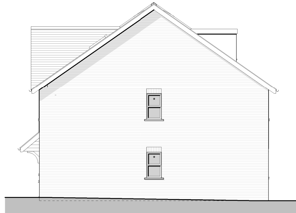
Plot 3 Right Elevation