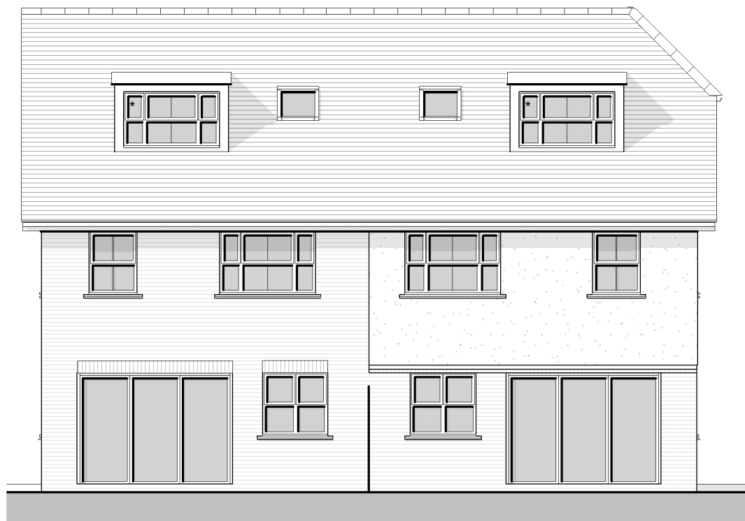
Plot 3 Plot 4 Rear Elevation