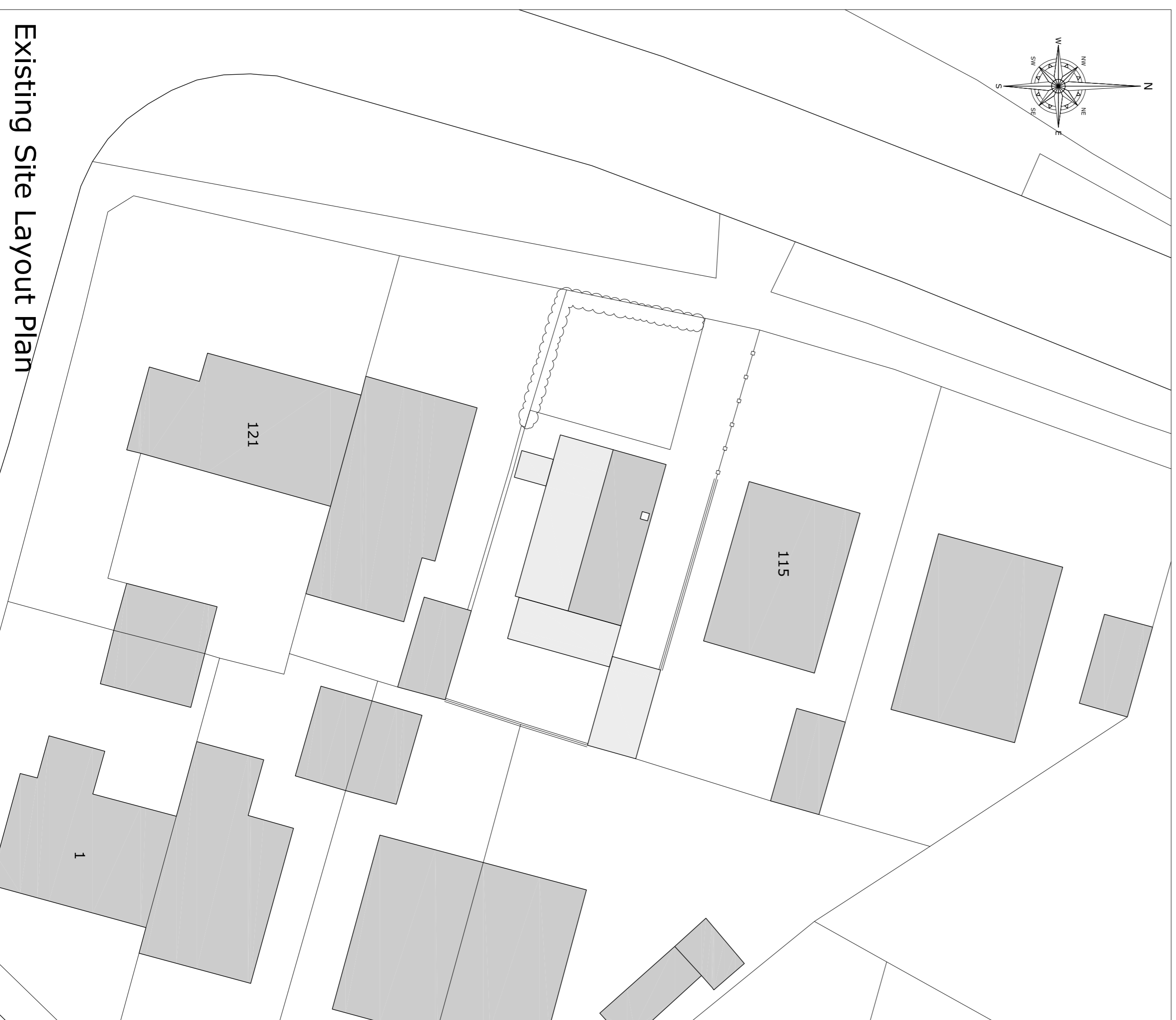
Existing Site Layout Plan