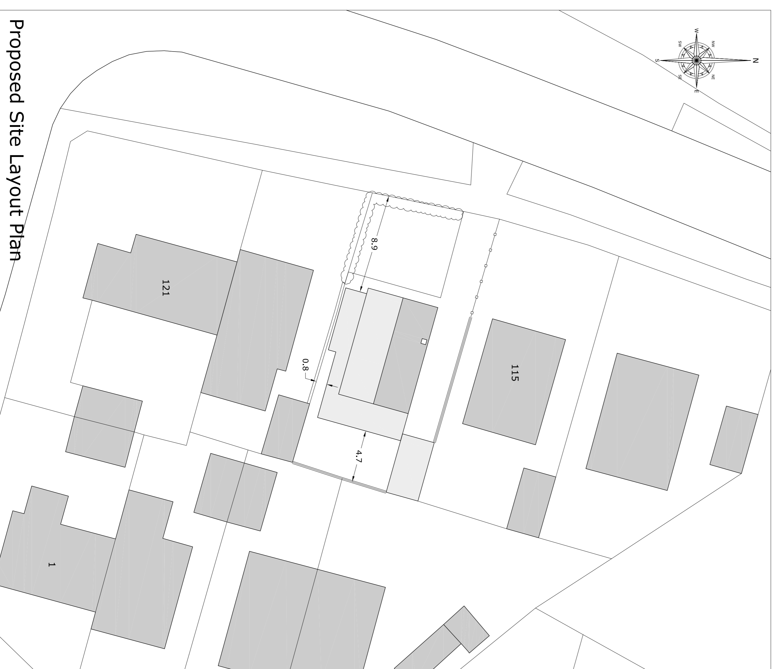
Proposed Site Layout Plan