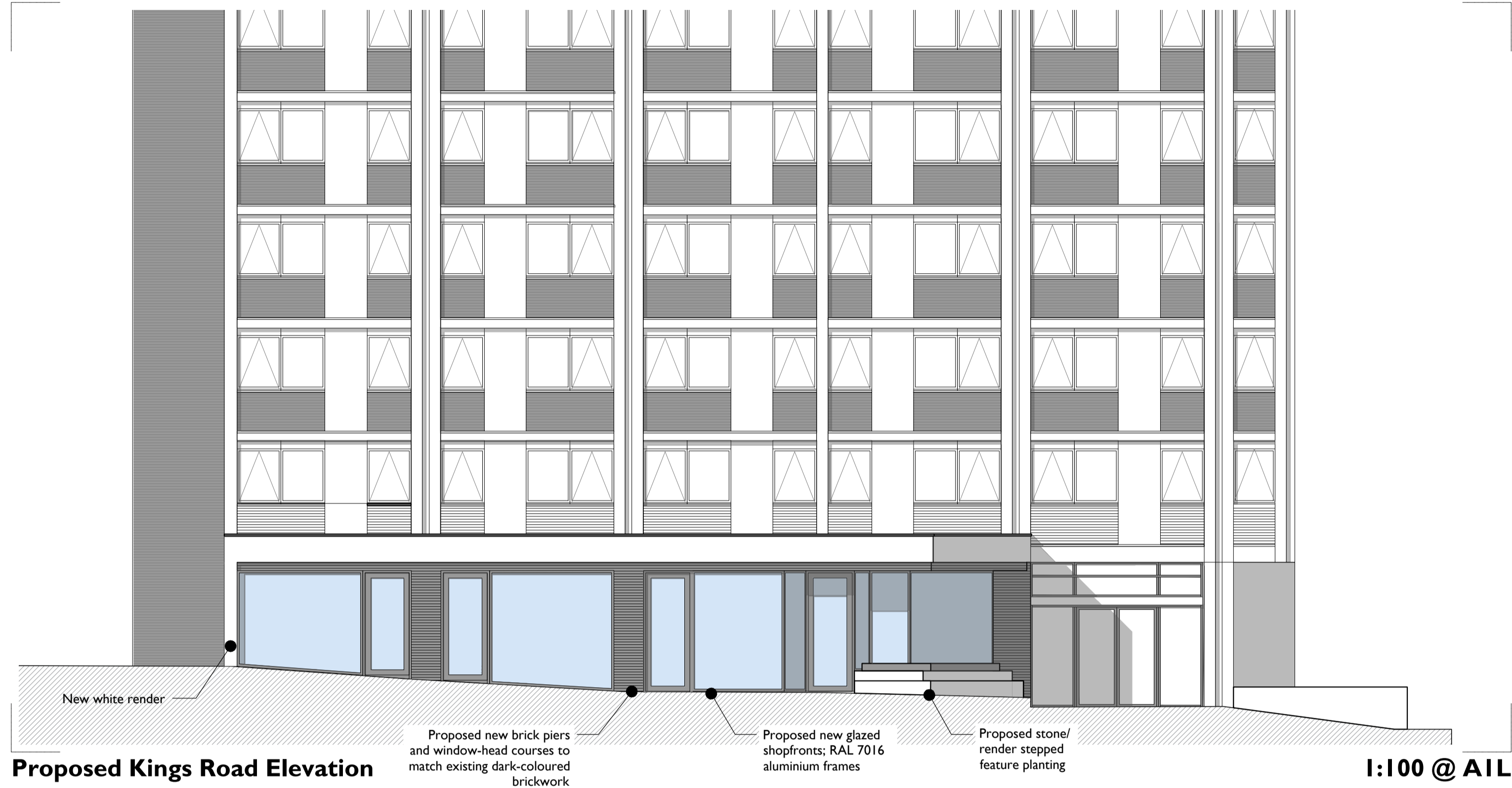
Proposed Kings Road Elevation