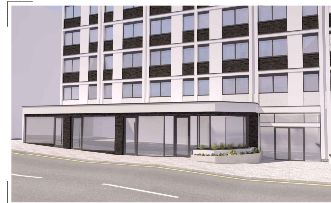
Proposed Kings Road Elevation