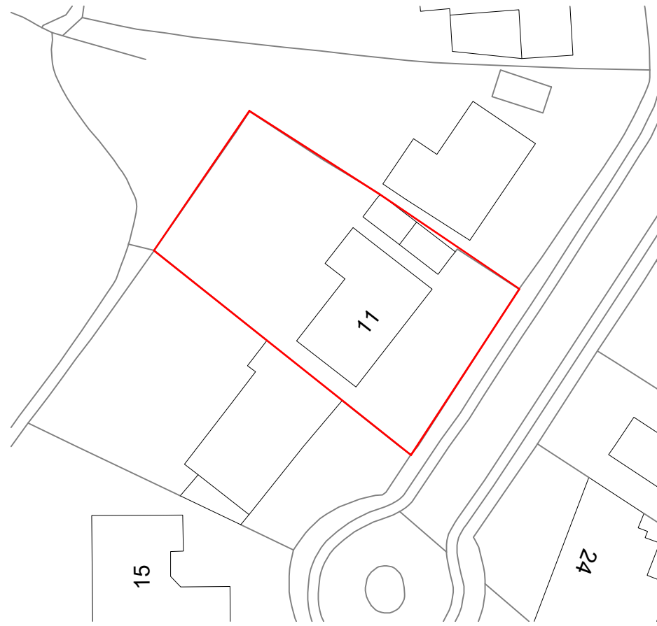
EXISTING BLOCK PLAN 1.500