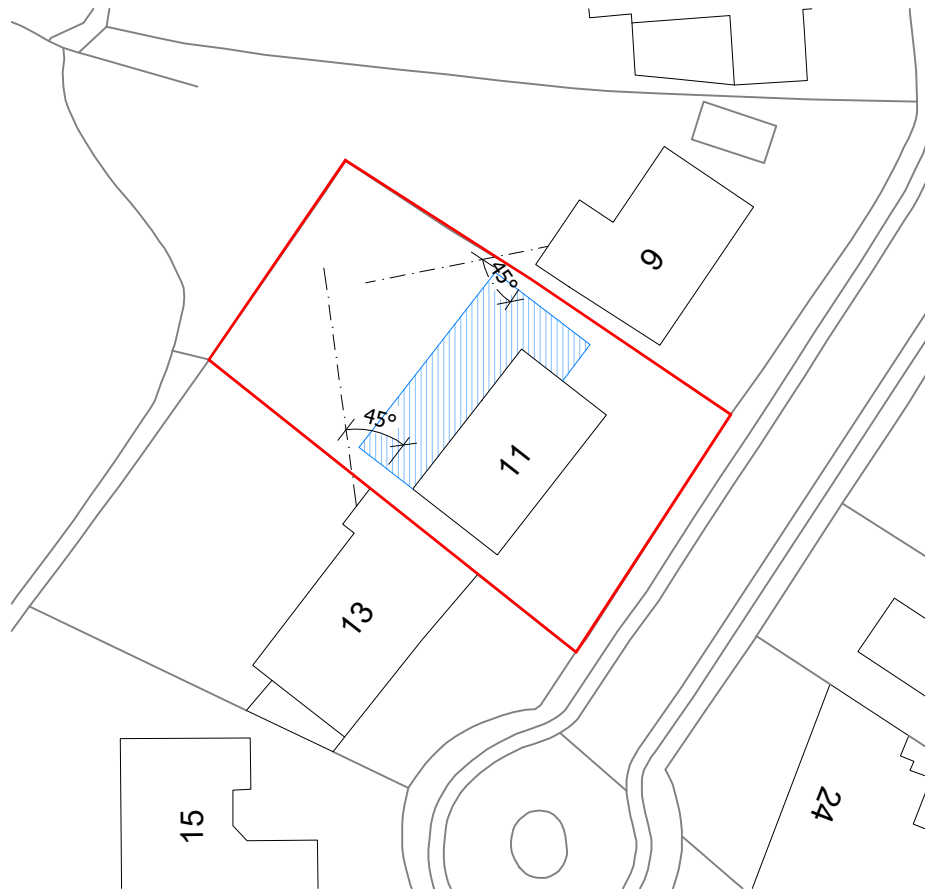
PROPOSED BLOCK PLAN 1.500