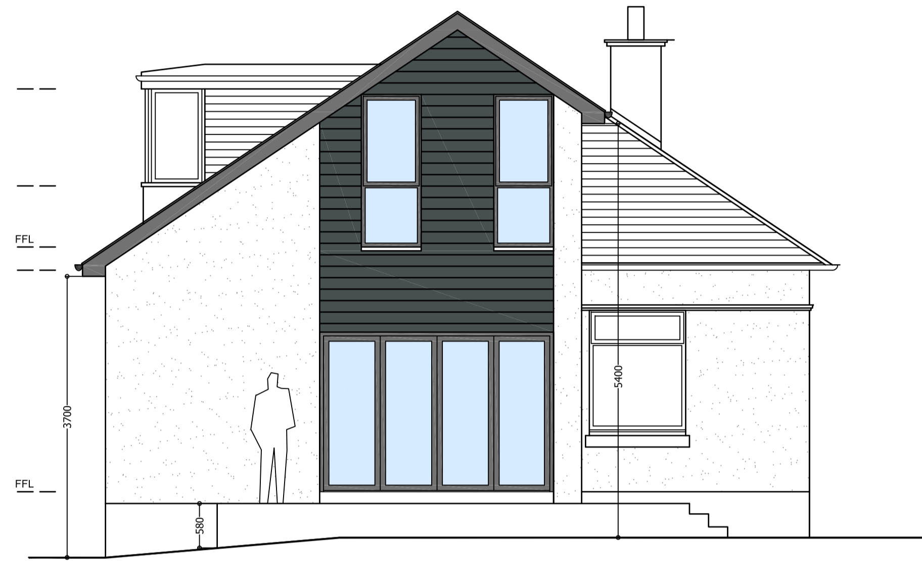
PROPOSED REAR ELEVATION TO WEST