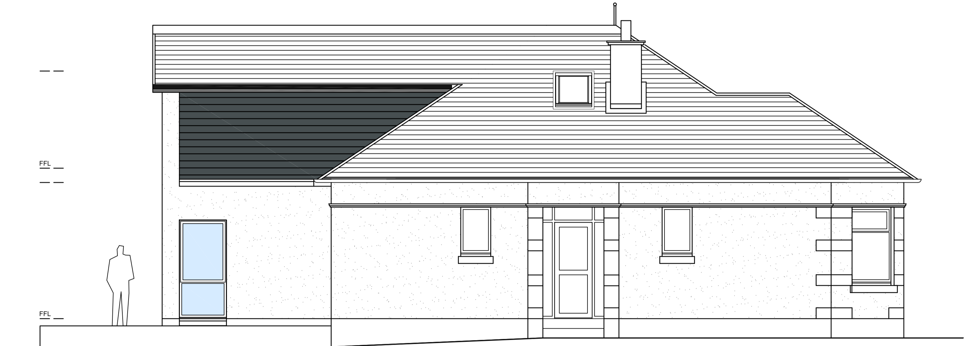
PROPOSED ENTRANCE TO SOUTH

FINISHES WALLS: WET DASH RENDER IN WHITE TO MATCH EXISTING CLADDING PANELS: COMPOSITE IN ANTHRACITE GREY ROOF: SLATE FASCIAS / SOFFITS: UPVC IN ANTHRACITE GREY WINDOWS / DOORS : COMPOSITE IN ANTHRACITE GREY