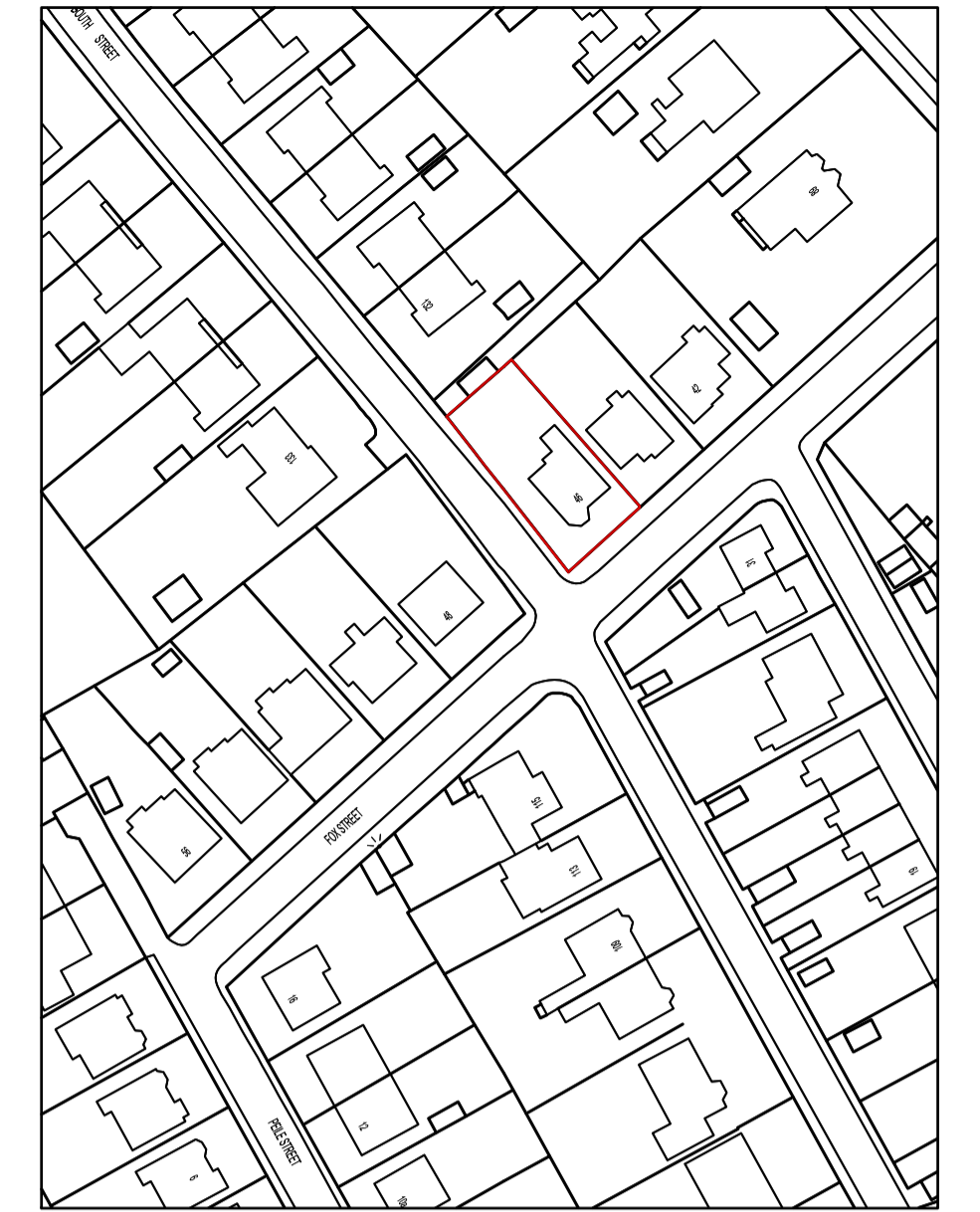
LOCATION PLAN - SCALE 1:1250 OS REPRODUCED UNDER LICENSE NO. AR 192023