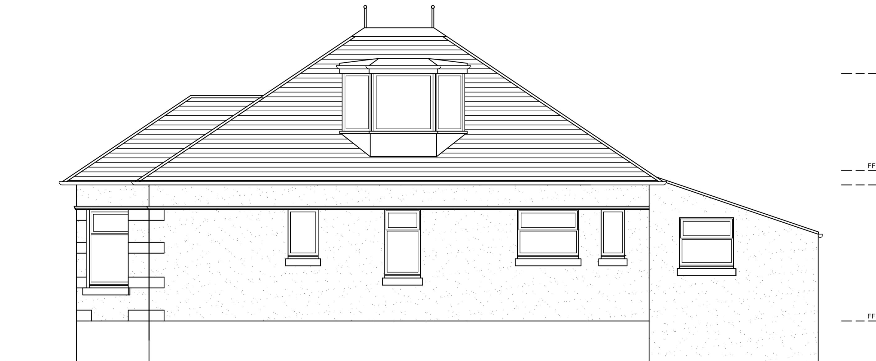
EXISTING SIDE ELEVATION TO NORTH

INTERNAL ALTERATIONS AND FORMATION OF TWO STOREY REAR EXTENSION