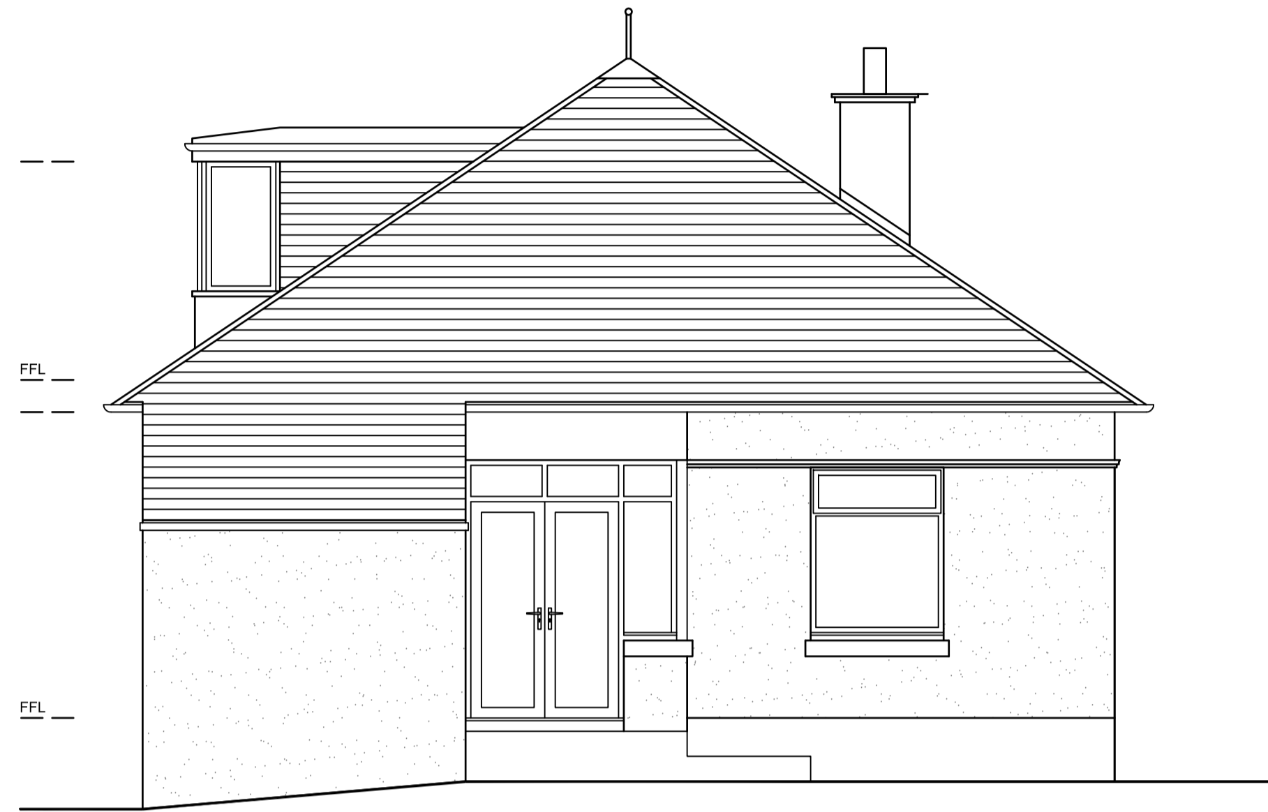
EXISTING REAR ELEVATION TO WEST