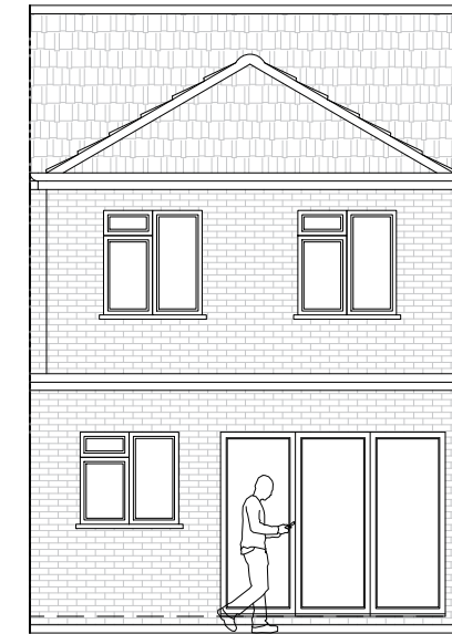
PRE-EXISTING REAR ELEVATION 1:100