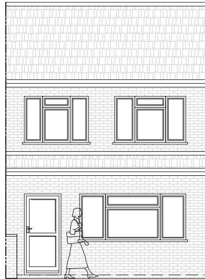
PRE-EXISTING FRONT ELEVATION 1:100