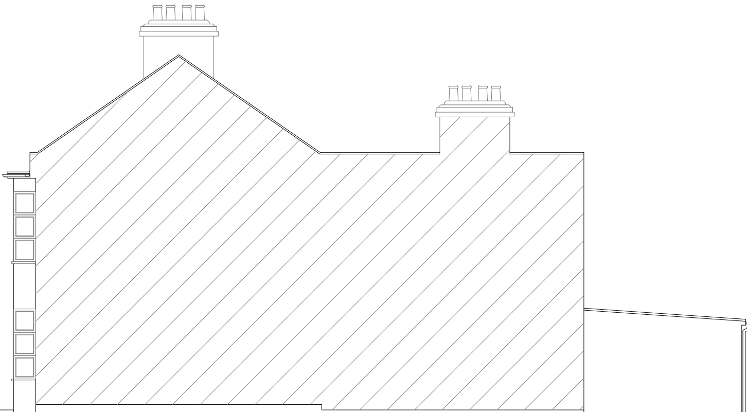
EXISTING (No.5) SIDE ELEVATION