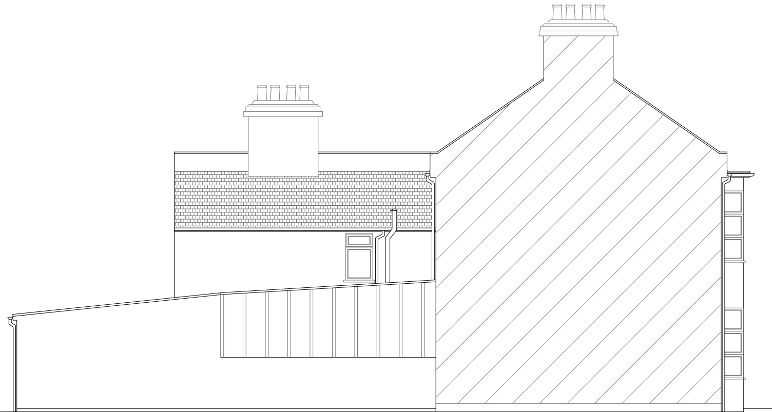
EXISTING (No.1) SIDE ELEVATION