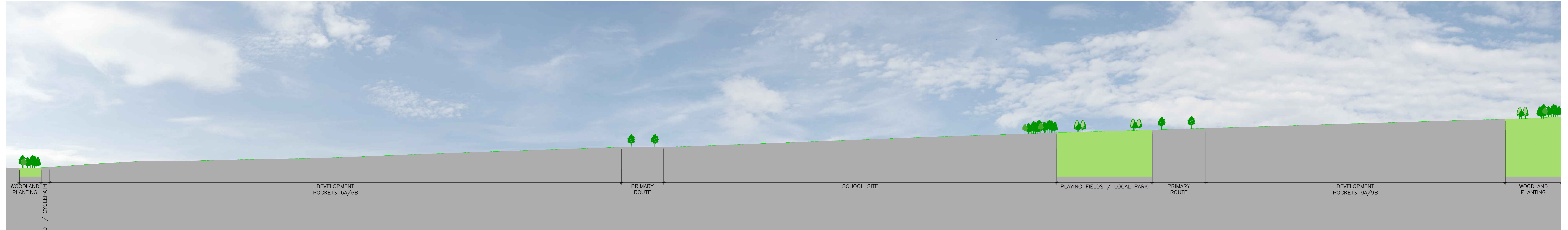
PROPOSED PHASE 2 SECTION B-B 1:1000 @ A0