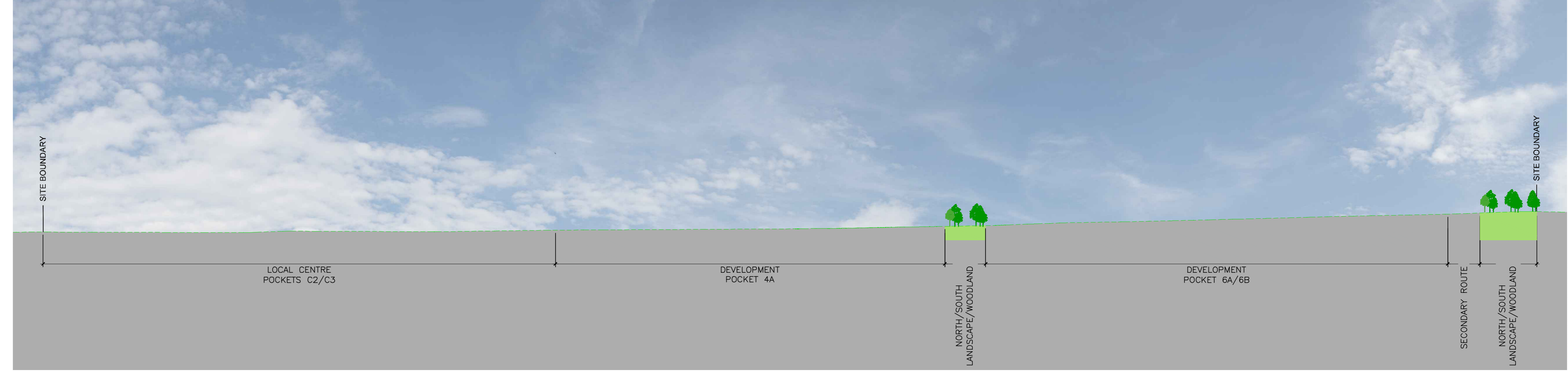
PROPOSED PHASE 2 SECTION A:A 1:1000 @ A0