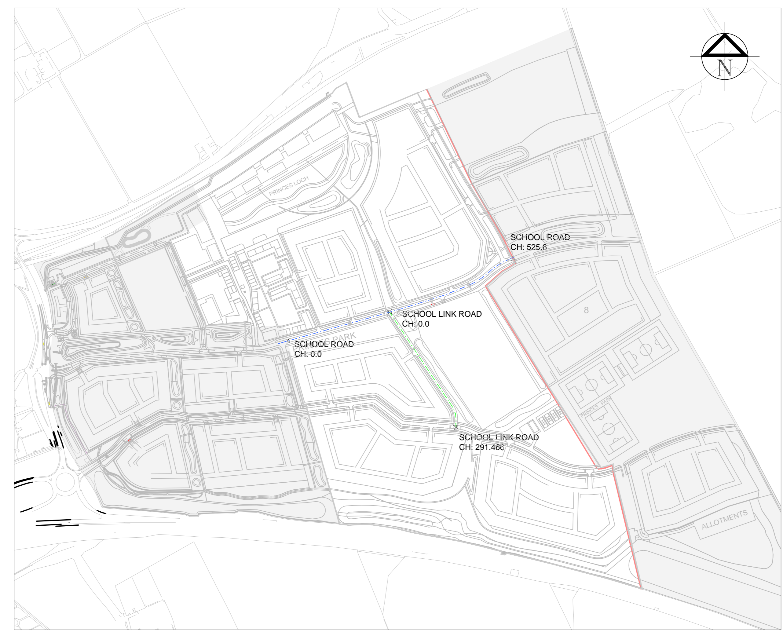
PROPOSED ROAD LONG SECTION LOCATIONS SCALE 1:5000