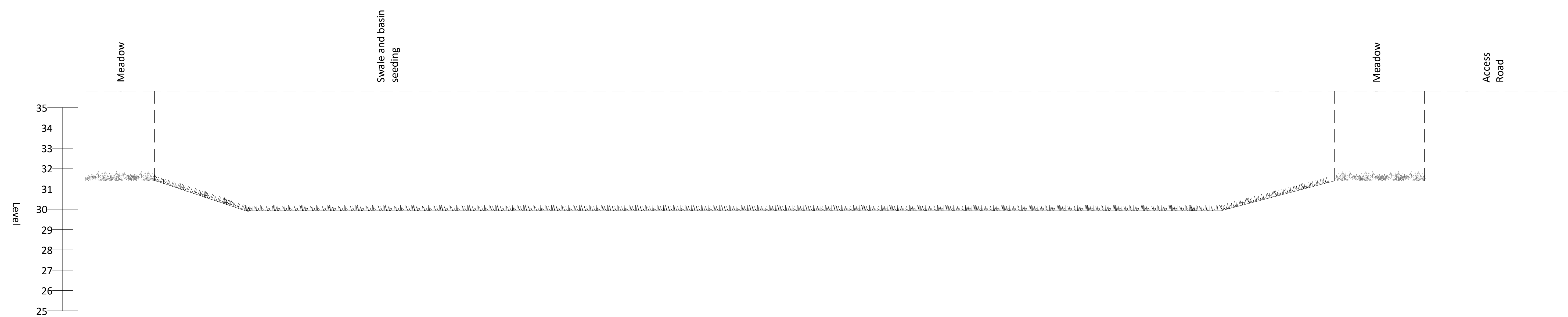
SUDS Basin Section 1 1 : 100